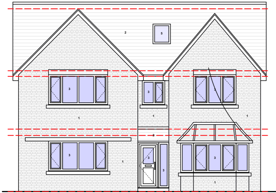
PROPOSED GA FRONT ELEVATION @1:100