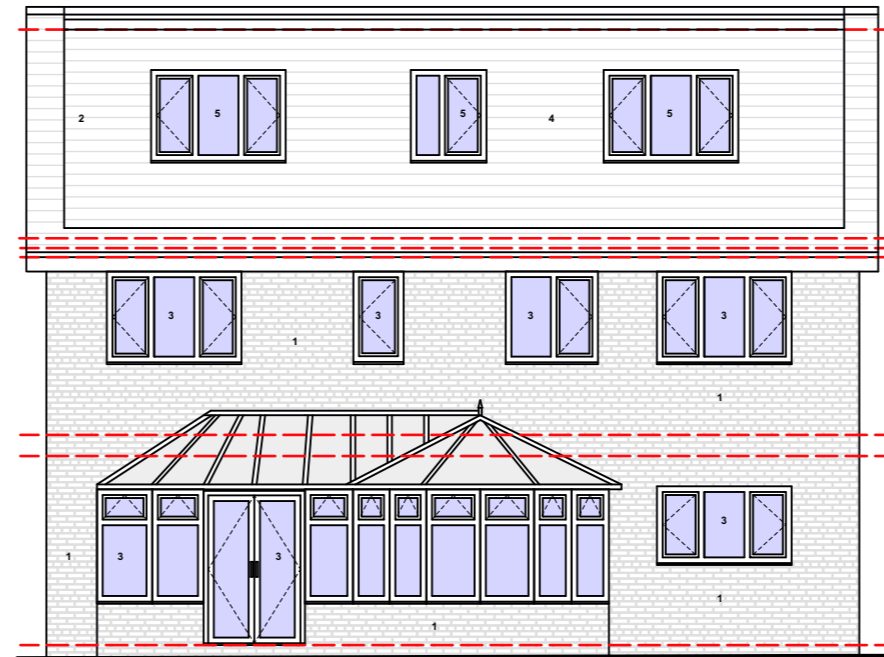
PROPOSED GA REAR ELEVATION @1:100