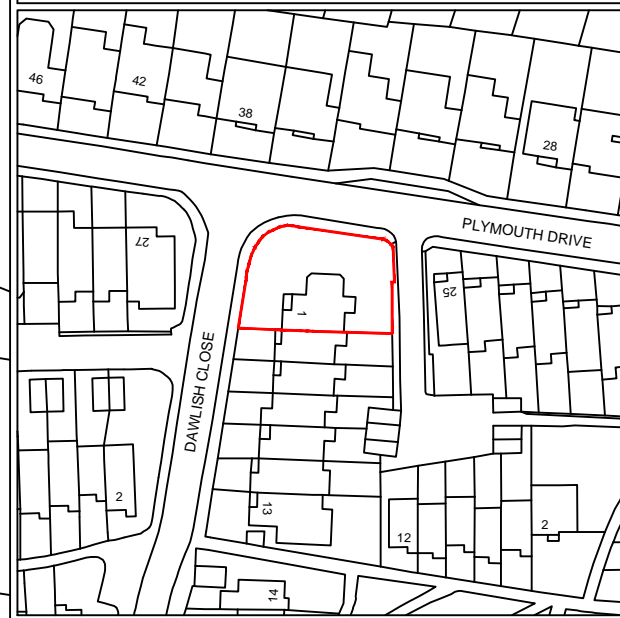
Location Plan (1:1250)

This drawing is protected by copyright and the information contained therein is the property of William McCall. The drawing must not be copied and the information contained therein may not be used or disclosed without written permission of and in the manner permitted by William McCall.