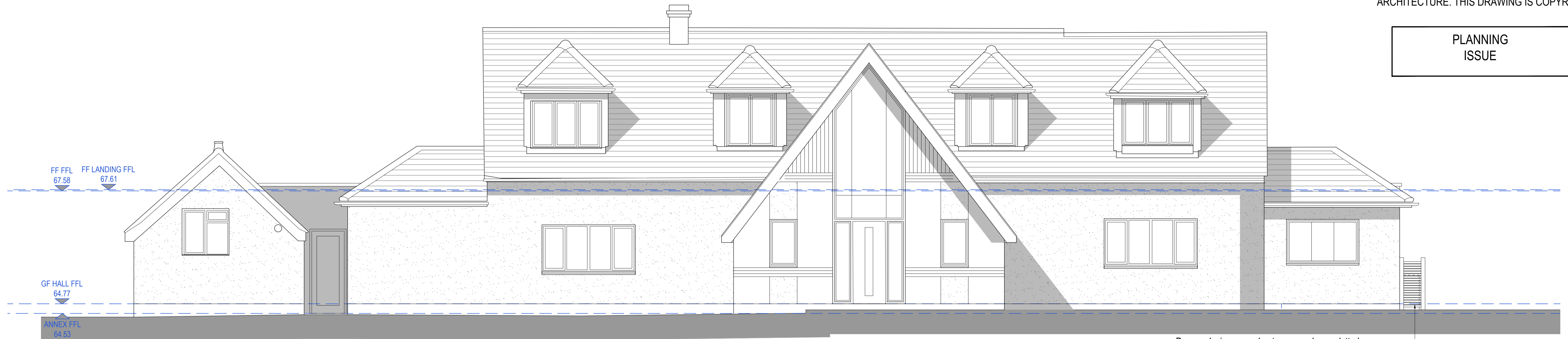
Proposed Front Elevation - 1:50 @ A1

Proposed air source heat pumps shown dotted - ASHP to be concealed behind cedar fencing