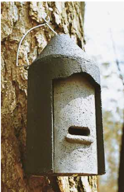
Bat Box 2F

Species such as the Lesser Noctule and the Common Noctule, as well as Daubenton's, Nathusius's Pipistrelle, Bechstein's Bat, are typical representatives of Bats that live in woods and forests. They prefer Bat Boxes as in nature they prefer, for example, woodpecker cavities and hollow tree branches. However, as old, diseased trees tend not to be available or rather are removed from managed forests, natural roosts for Bats have become scarce. Bat Boxes can provide a remedy and are readily accepted by the animals. So-called "House Bats" are mainly those species that live in buildings, for example, in roller shutter boxes, behind window shutters, niches and gaps. These are, above all, Mouse-Eared and Pipistrelle Bats. These Bats prefer, for example, flat boxes or round boxes with several horizontal partitions.