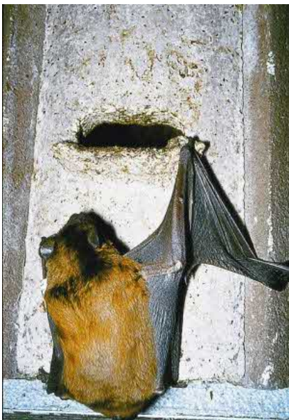
Common Noctule Bat at the entrance hole of a 2F Bat Box

Material: SCHWEGLER Wood-Concrete Nest Box. Hanger: steel, galvanised.