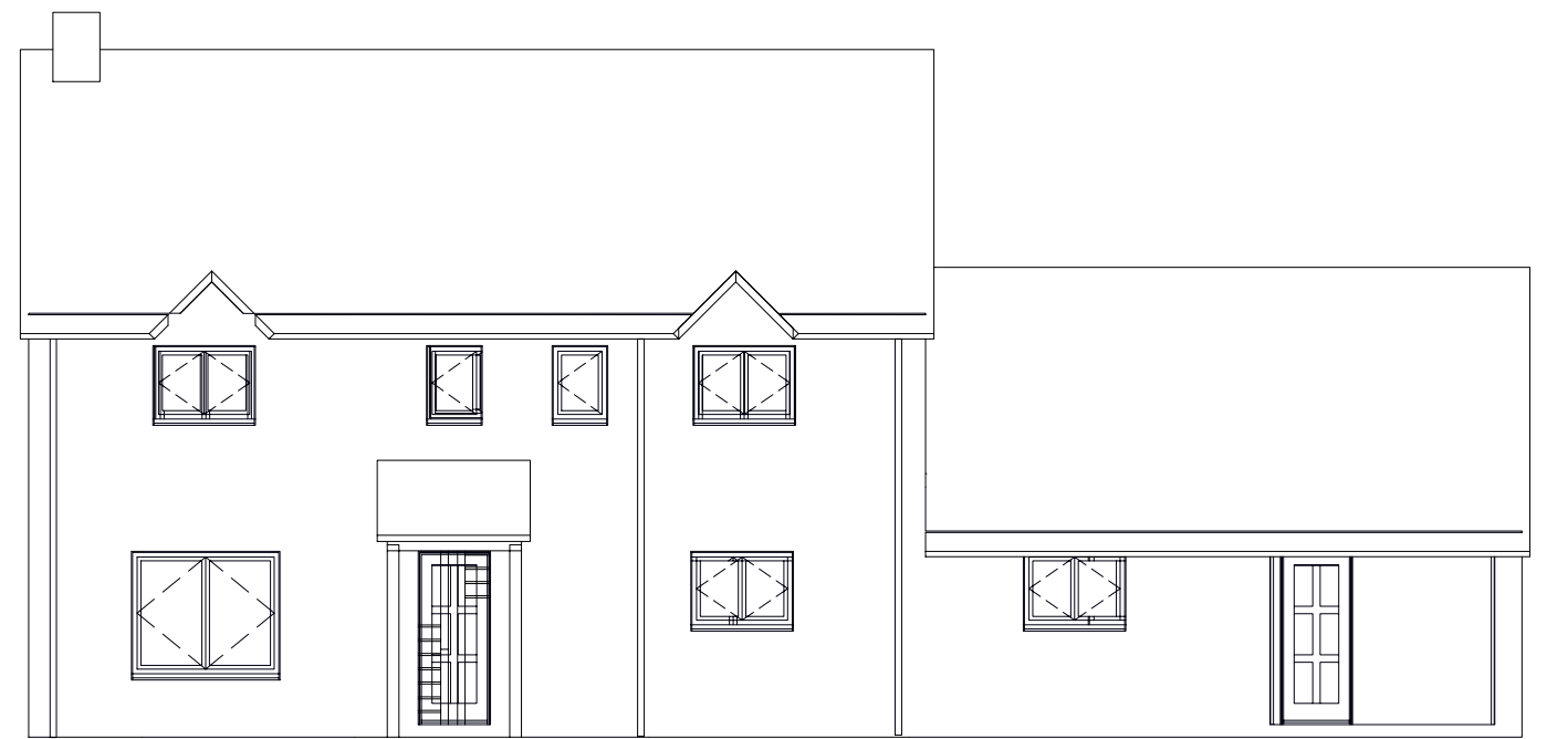
SOUTH SE ELEVATION