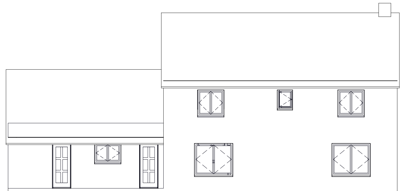
NORTH NW ELEVATION