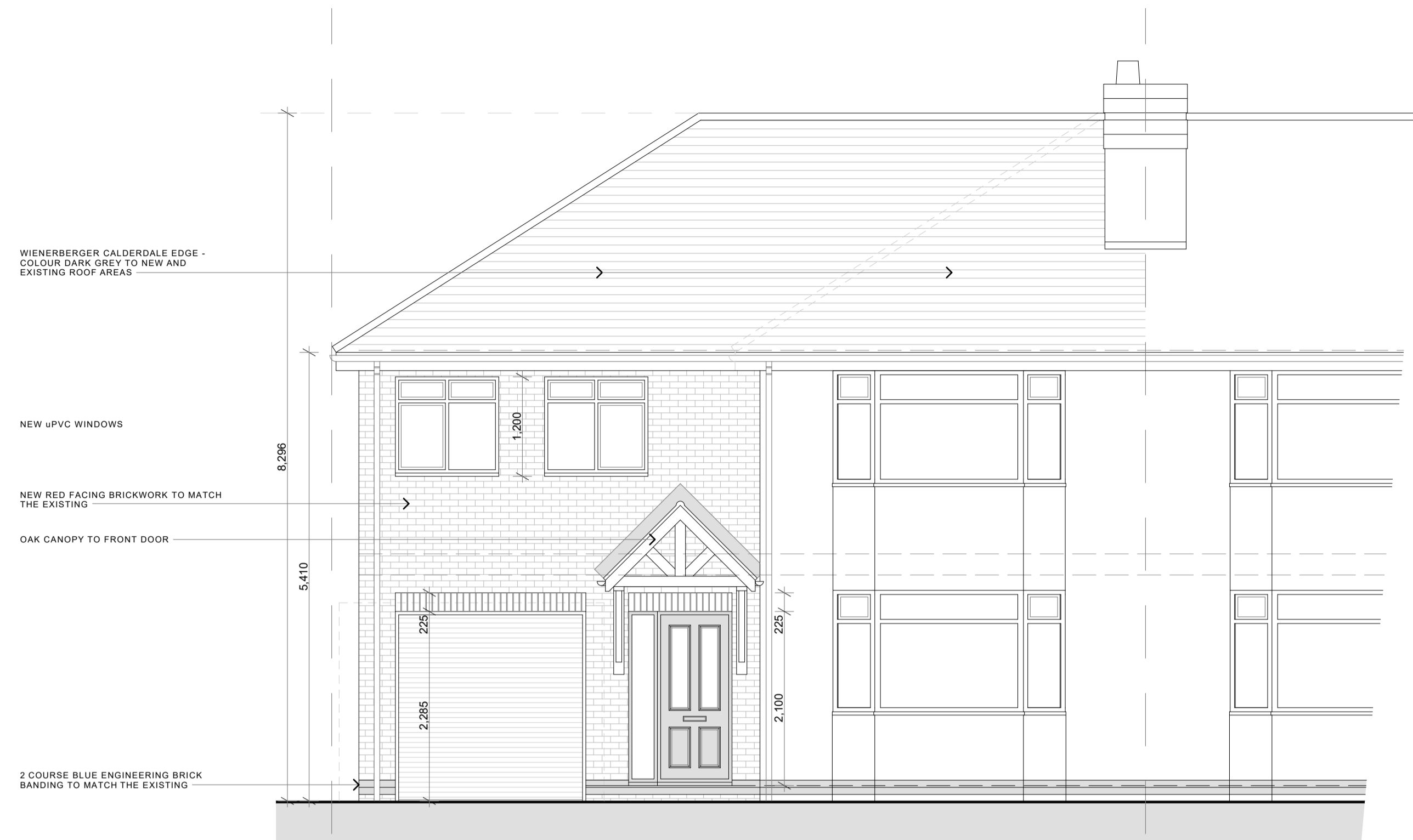
PROPOSED FRONT (SOUTH WEST) ELEVATION