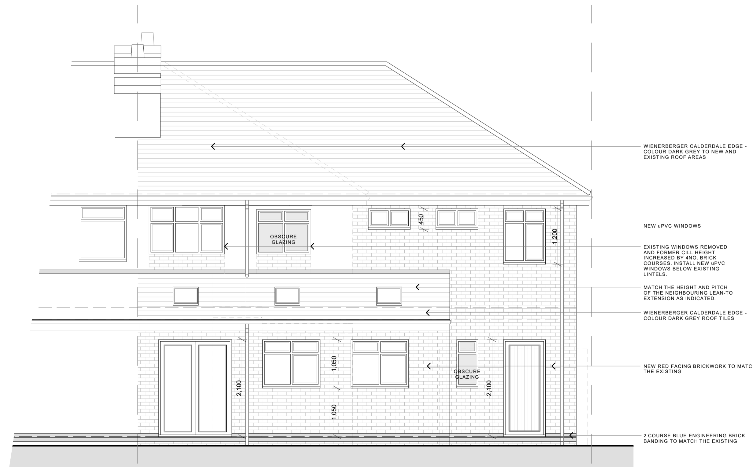
PROPOSED REAR (NORTH EAST) ELEVATION