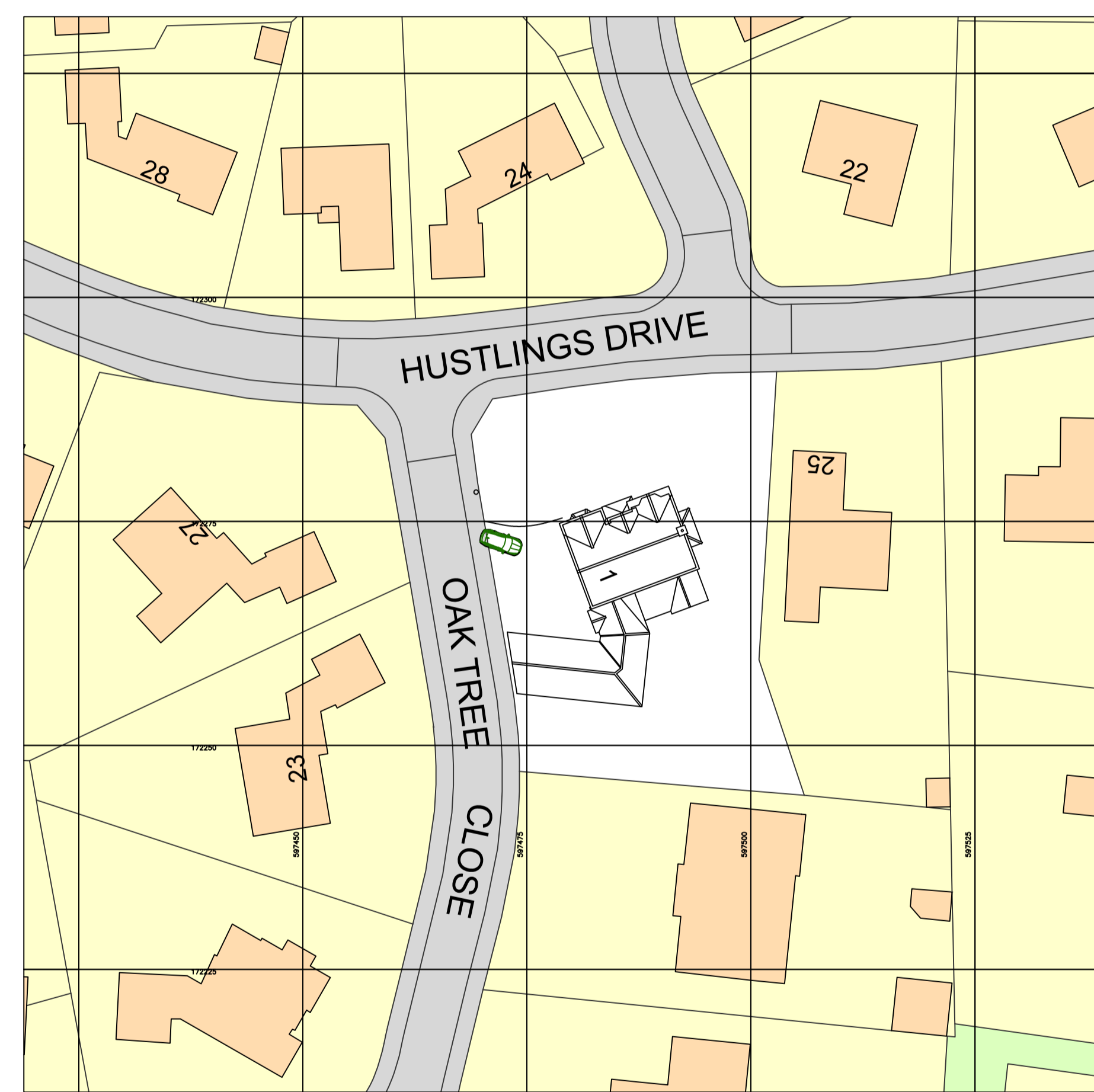
03 Proposed Block Plan Scale 1:500