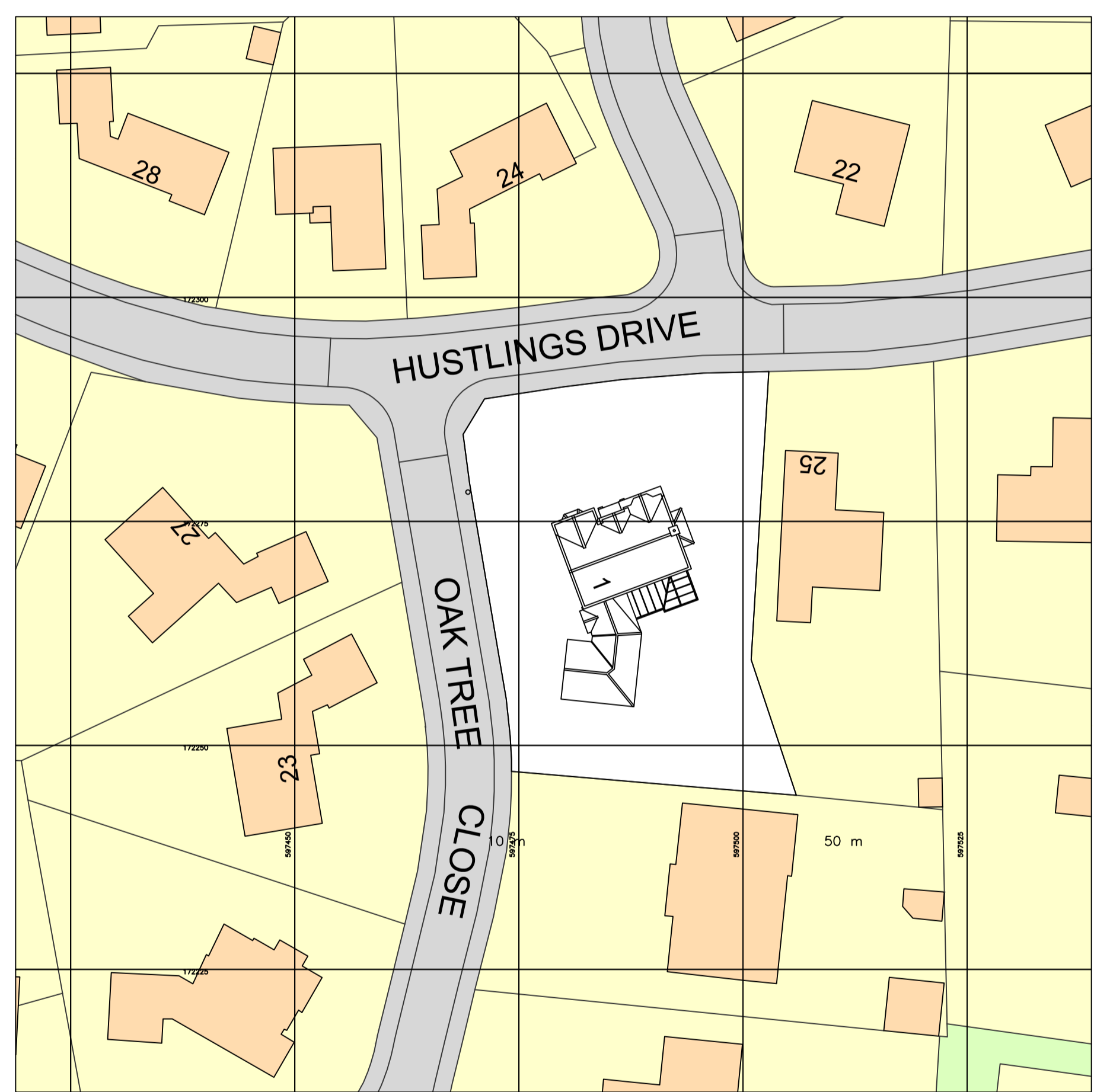
02 Existing Block Plan Scale 1:500

Kent - London - South East (e) info@JAT-Surv.com (w) www.JAT-Surv.com (m) 07540 651867 (t) 01795 536840