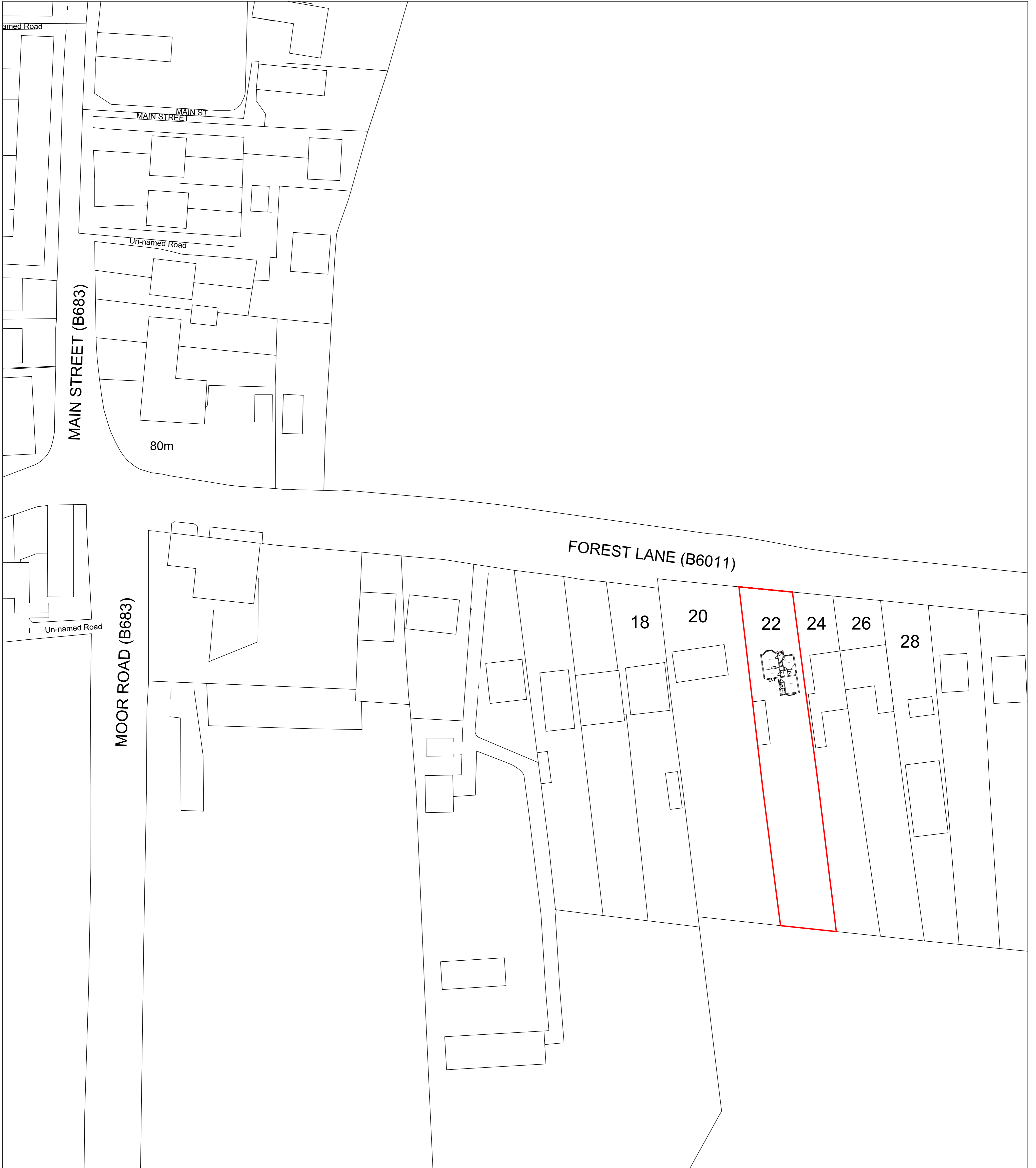
Existing Site Plan 1:500