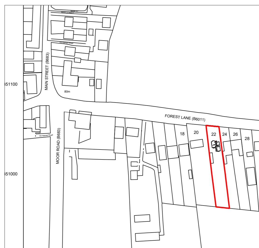
Existing Location Plan 1:1250