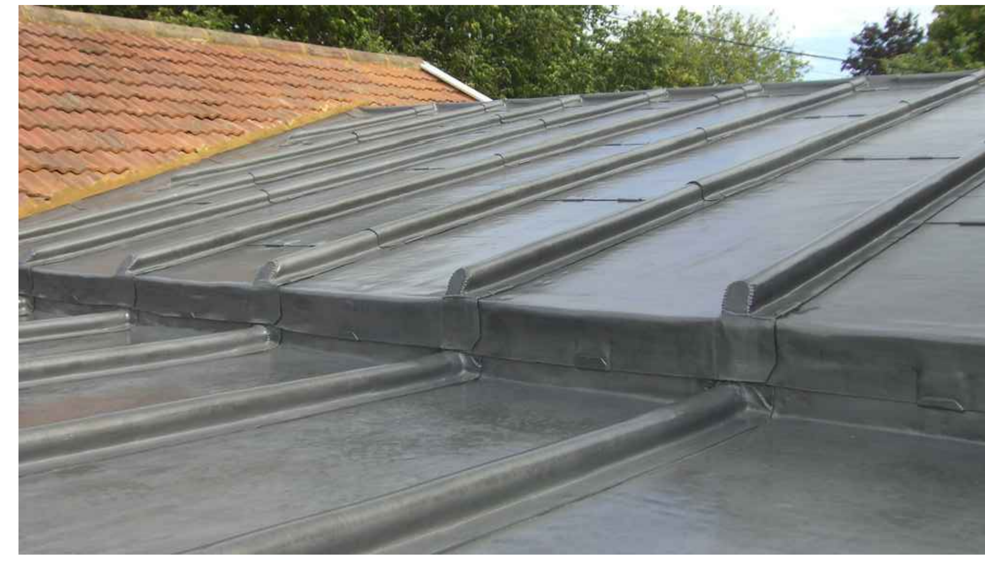
LEAD ROOF WITH LEAD ROLLS IMAGE PRECEDENT