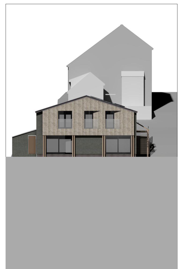
PROPOSED SITE ELEVATION

Scale bar showing 0 to 10 meters. scale in metres at original 1:200 scale on A1 size drawing