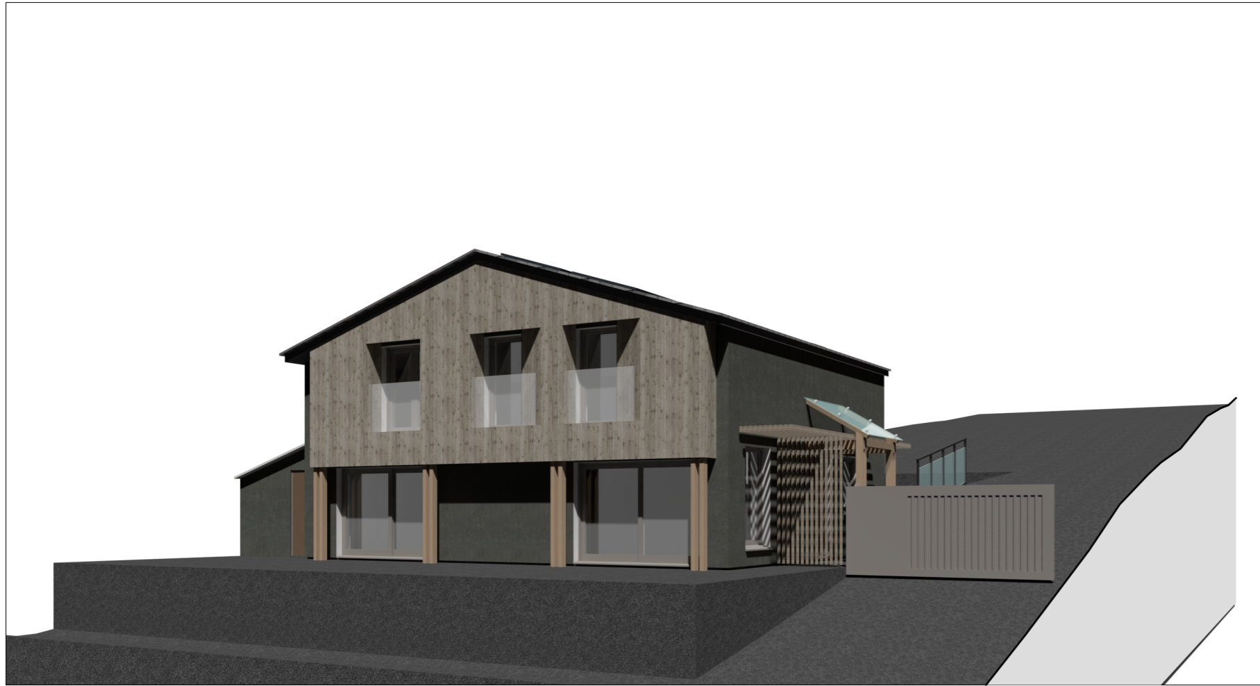
SKETCH VIEW FROM SOUTHWEST