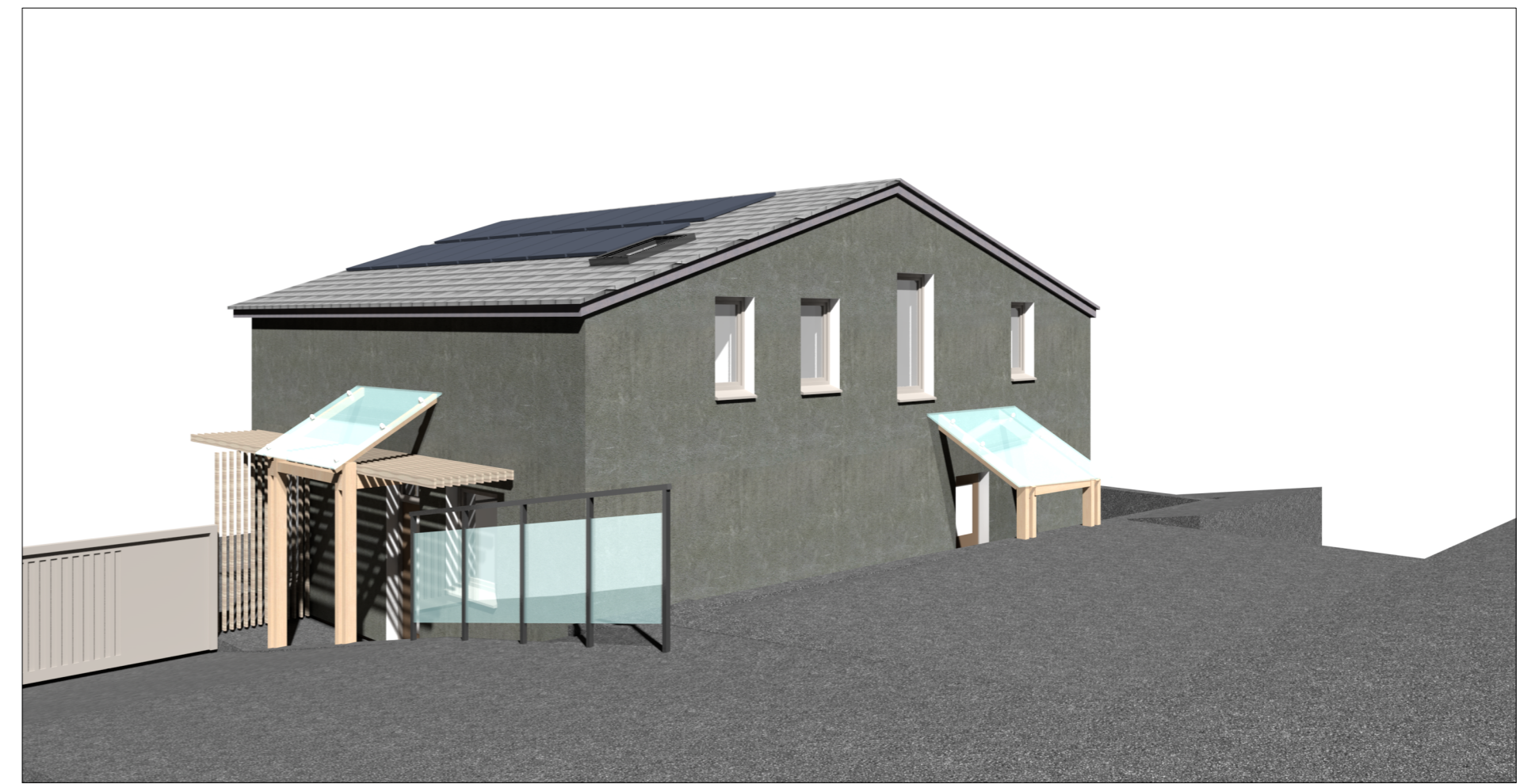
SKETCH VIEW FROM SOUTHEAST