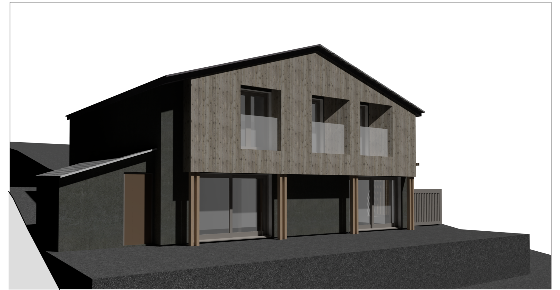
SKETCH VIEW FROM NORTHWEST