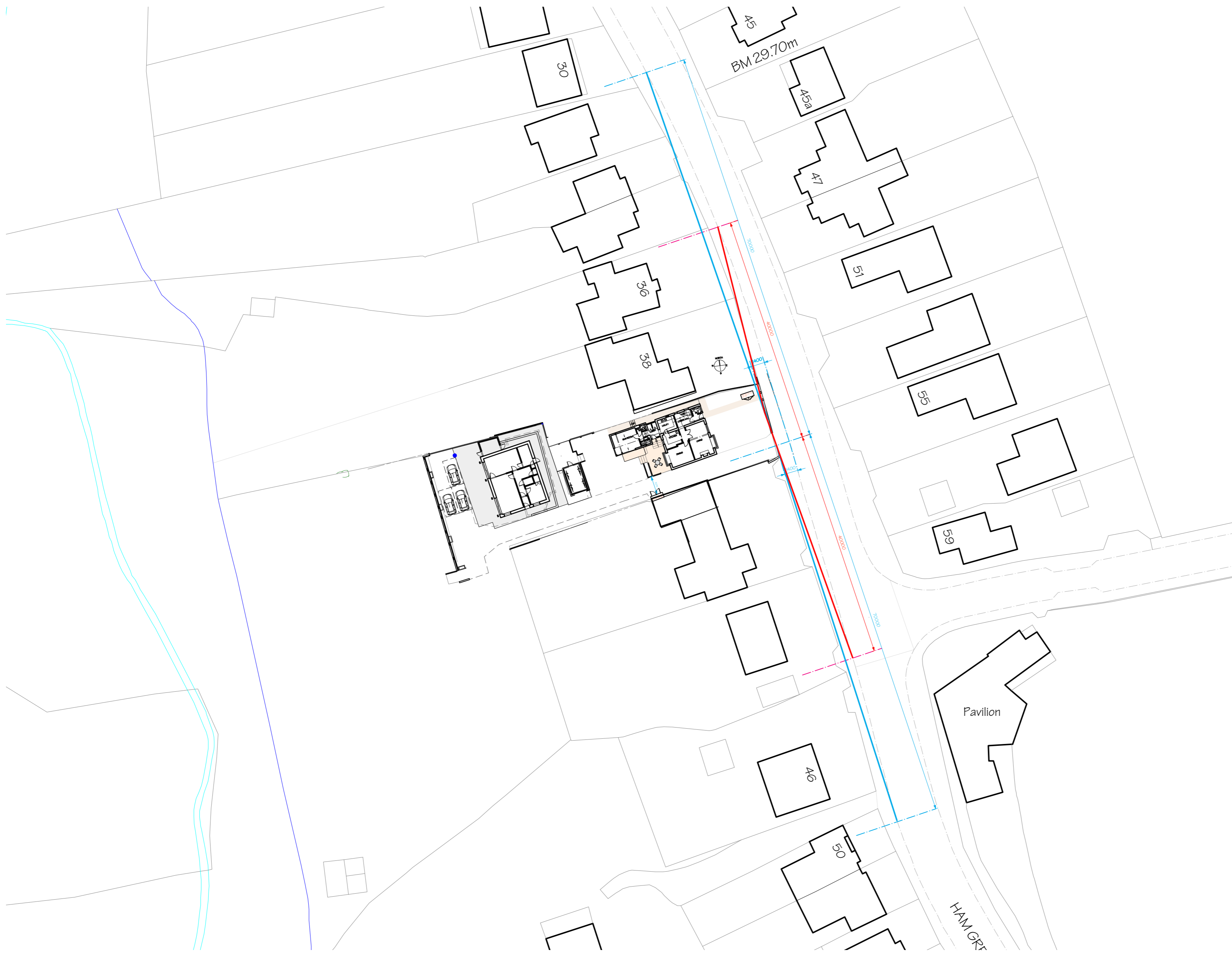
PLAN SHOWING VISIBILITY SPLAYS FOR EXISTING DRIVE TO 40 HAM GREEN WHICH ALSO BECOMES ACCESS TO PROPOSED NEW HOUSE