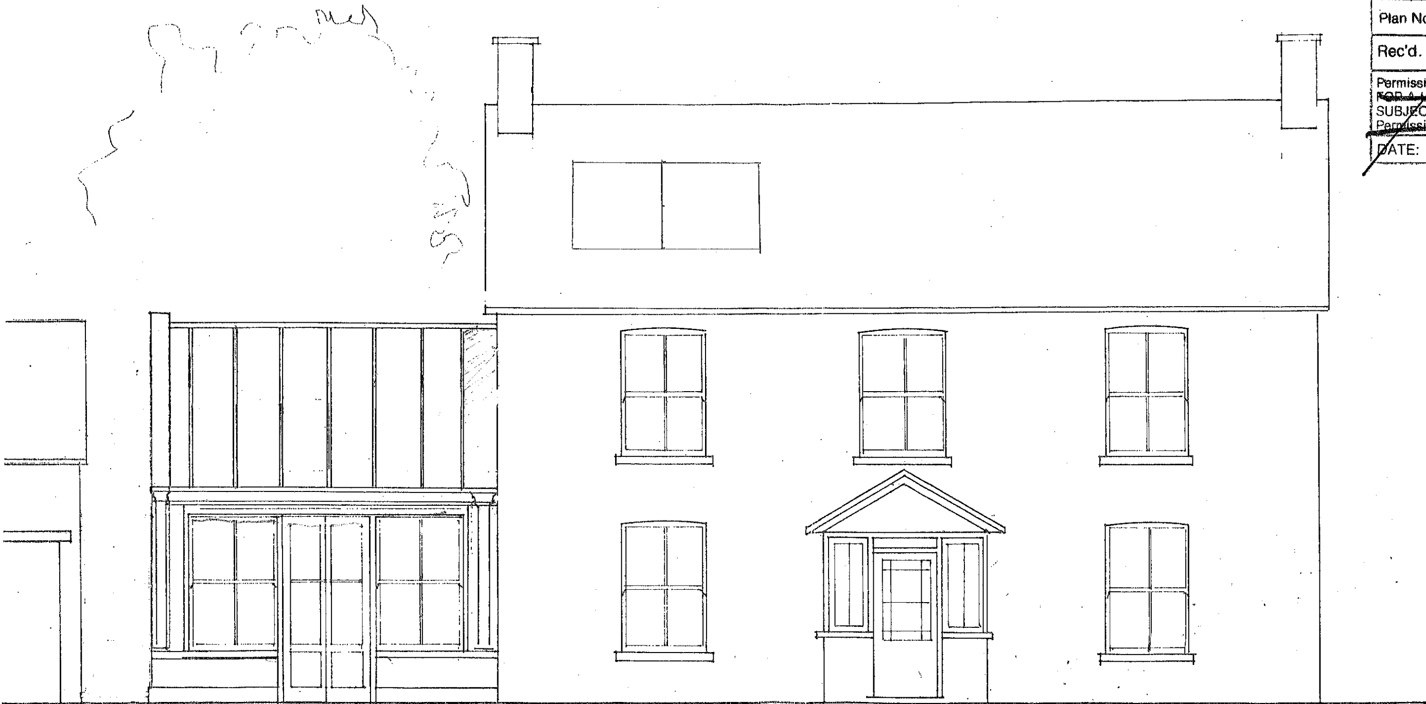
MULBERRY HOUSE SOUTH EAST ELEVATION EXISTING