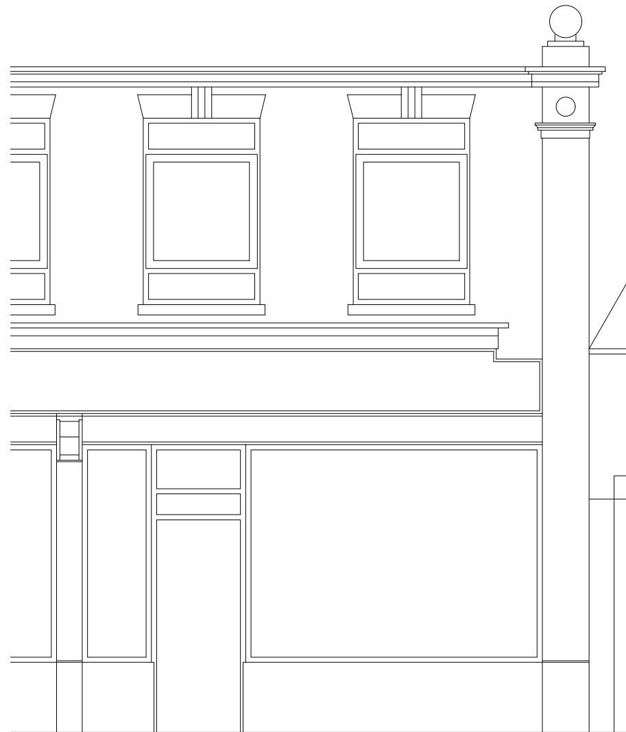
Existing Front Elevation 1:50