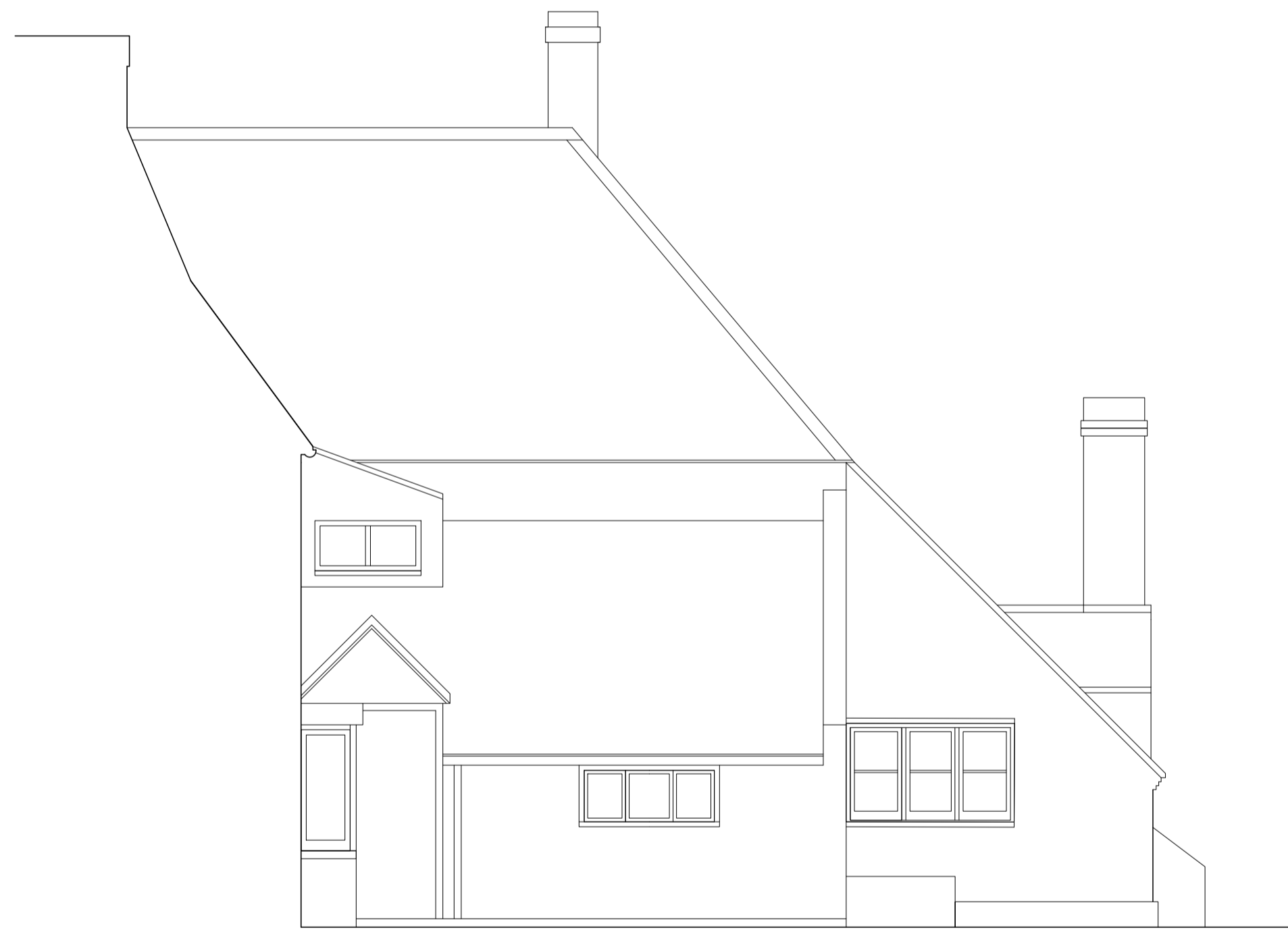
Existing Rear Yard Right Side Elevation @ 1:50