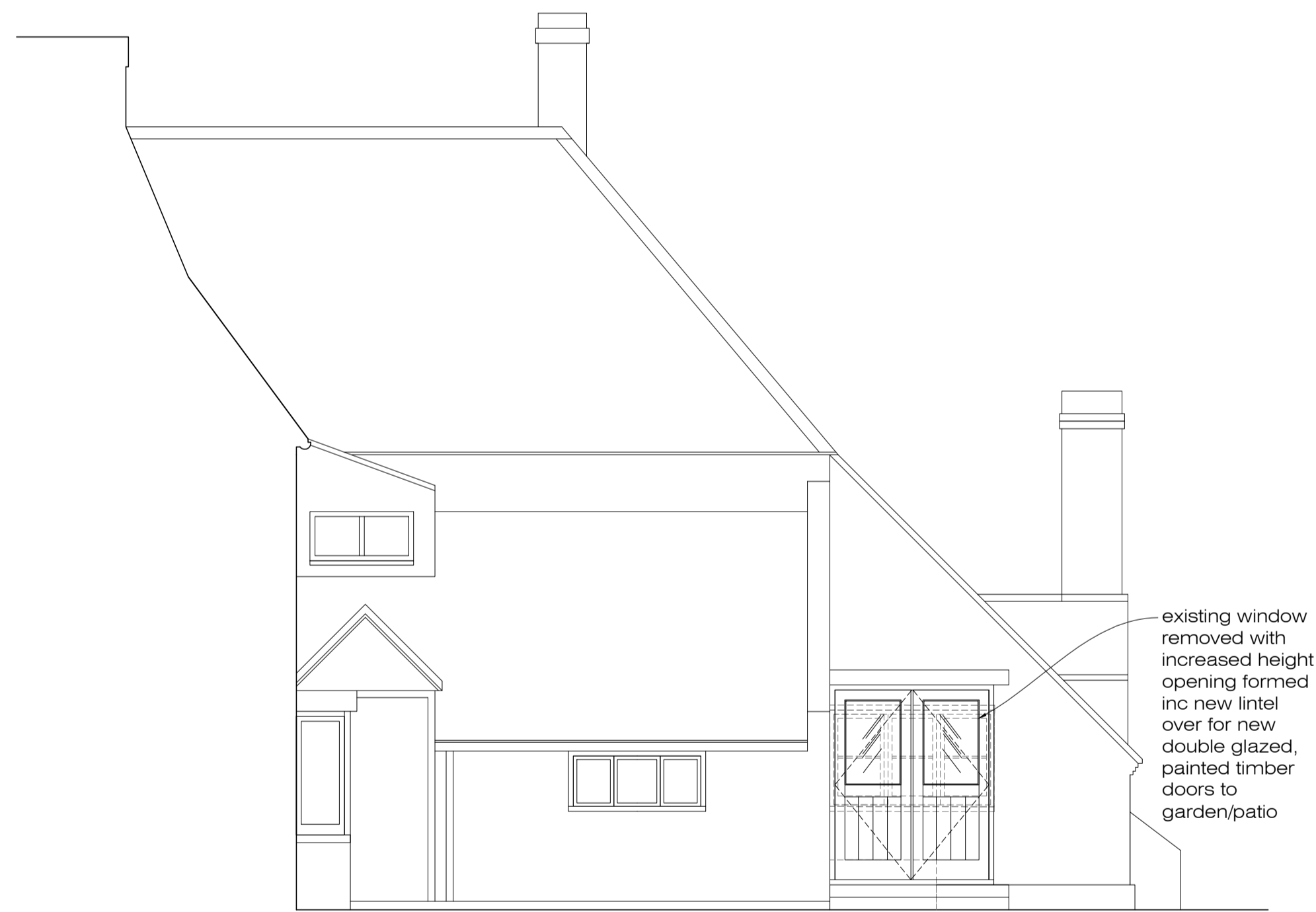
Proposed Rear Yard Right Side Elevation @ 1:50