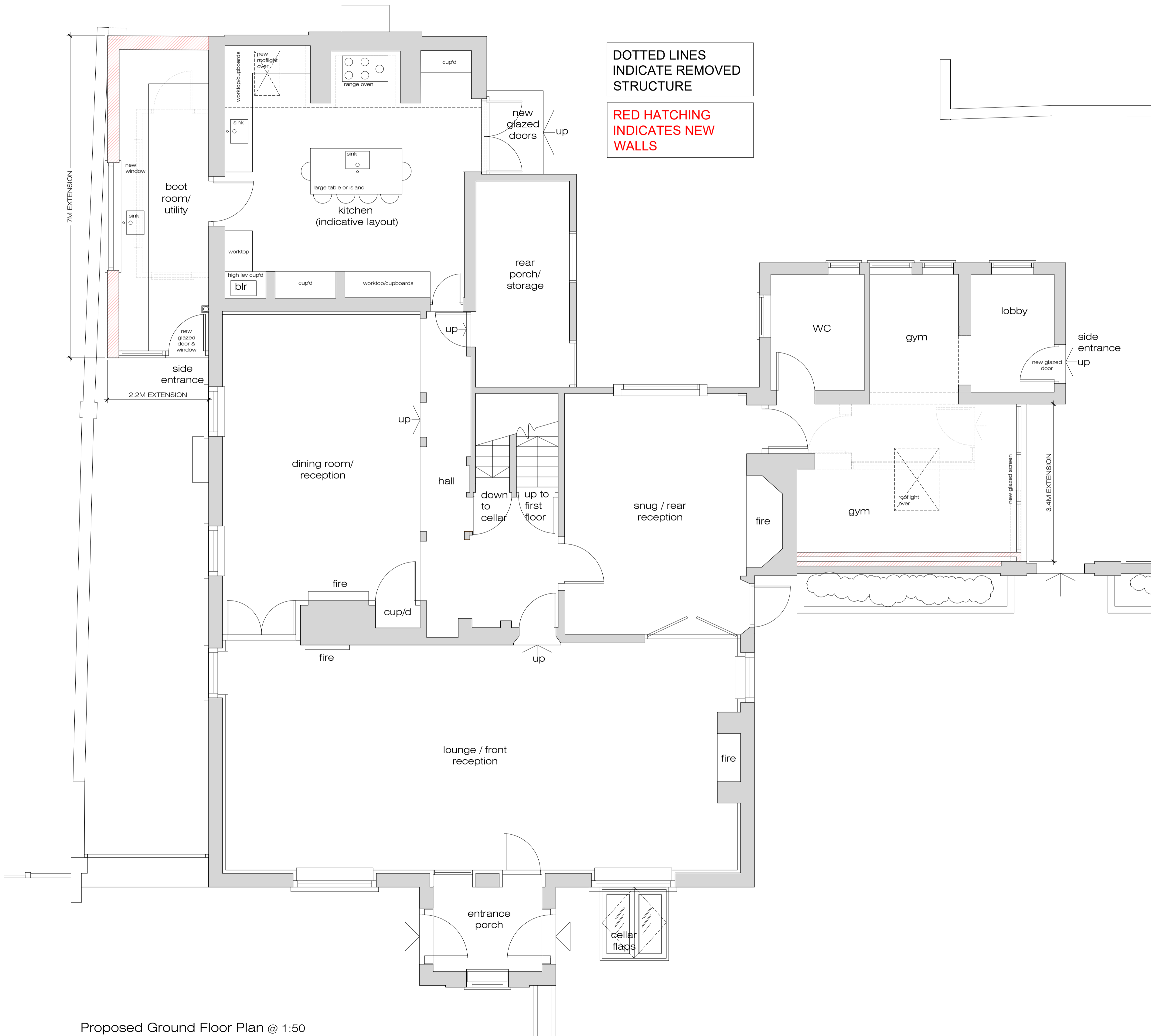
Proposed Ground Floor Plan @ 1:50