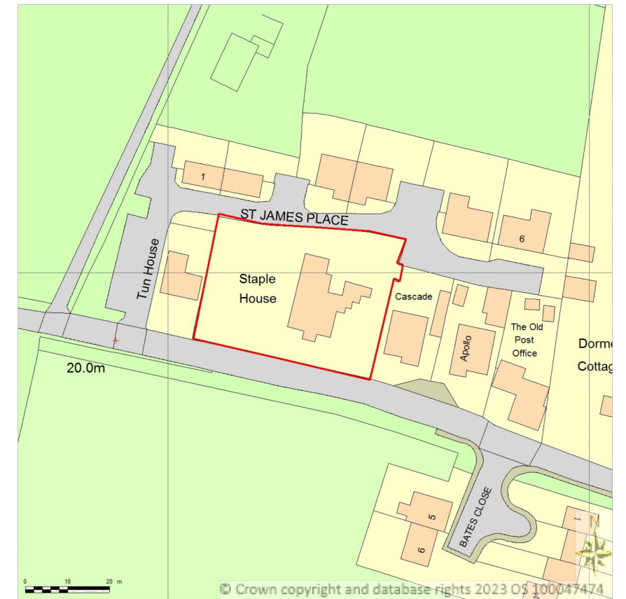
Existing Location Plan @ 1:1250