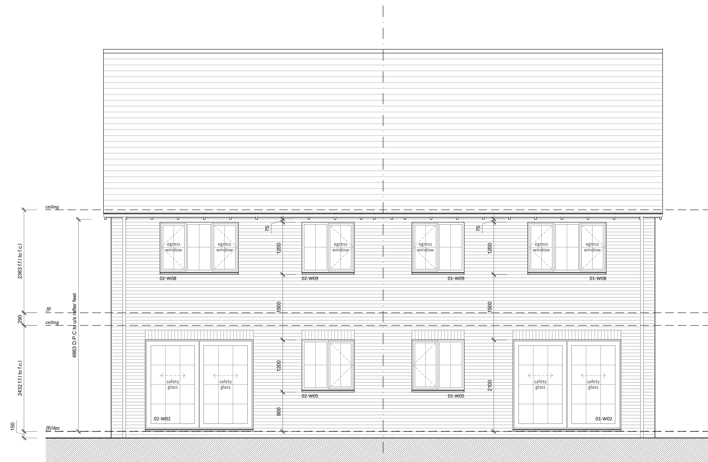
REAR (SOUTH FACING) ELEVATION