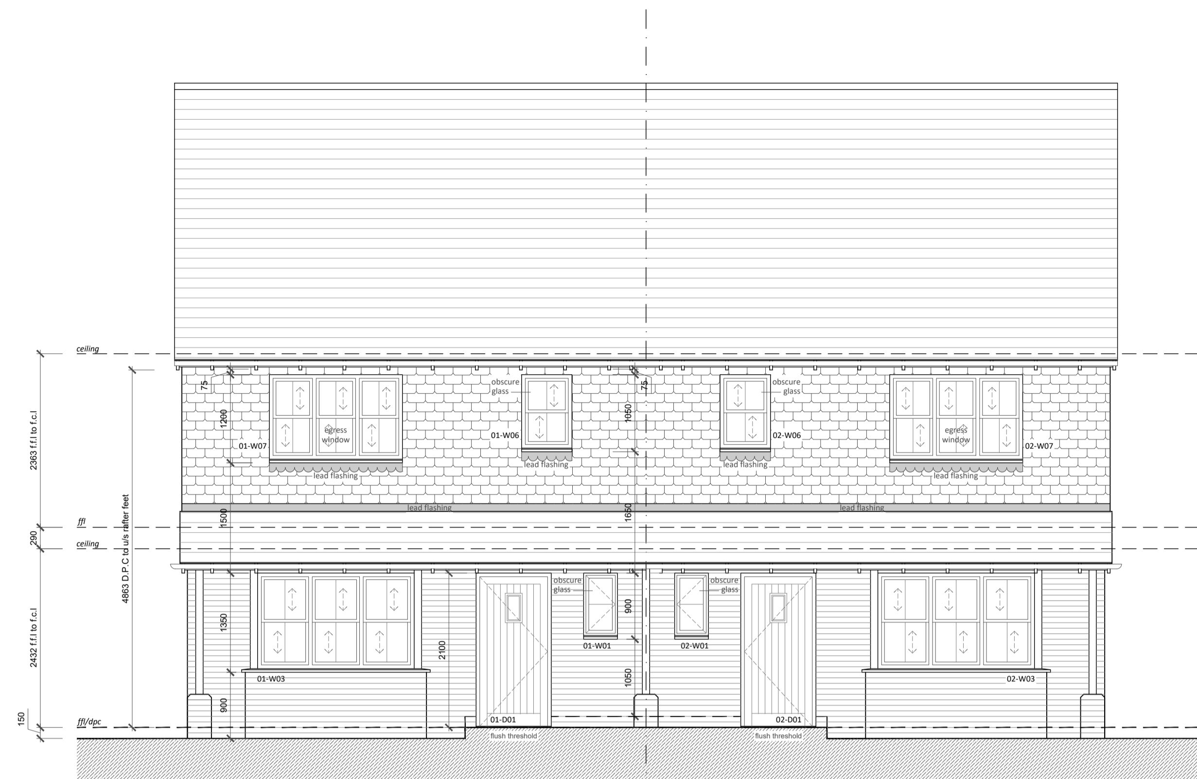
FRONT (NORTH FACING) ELEVATION