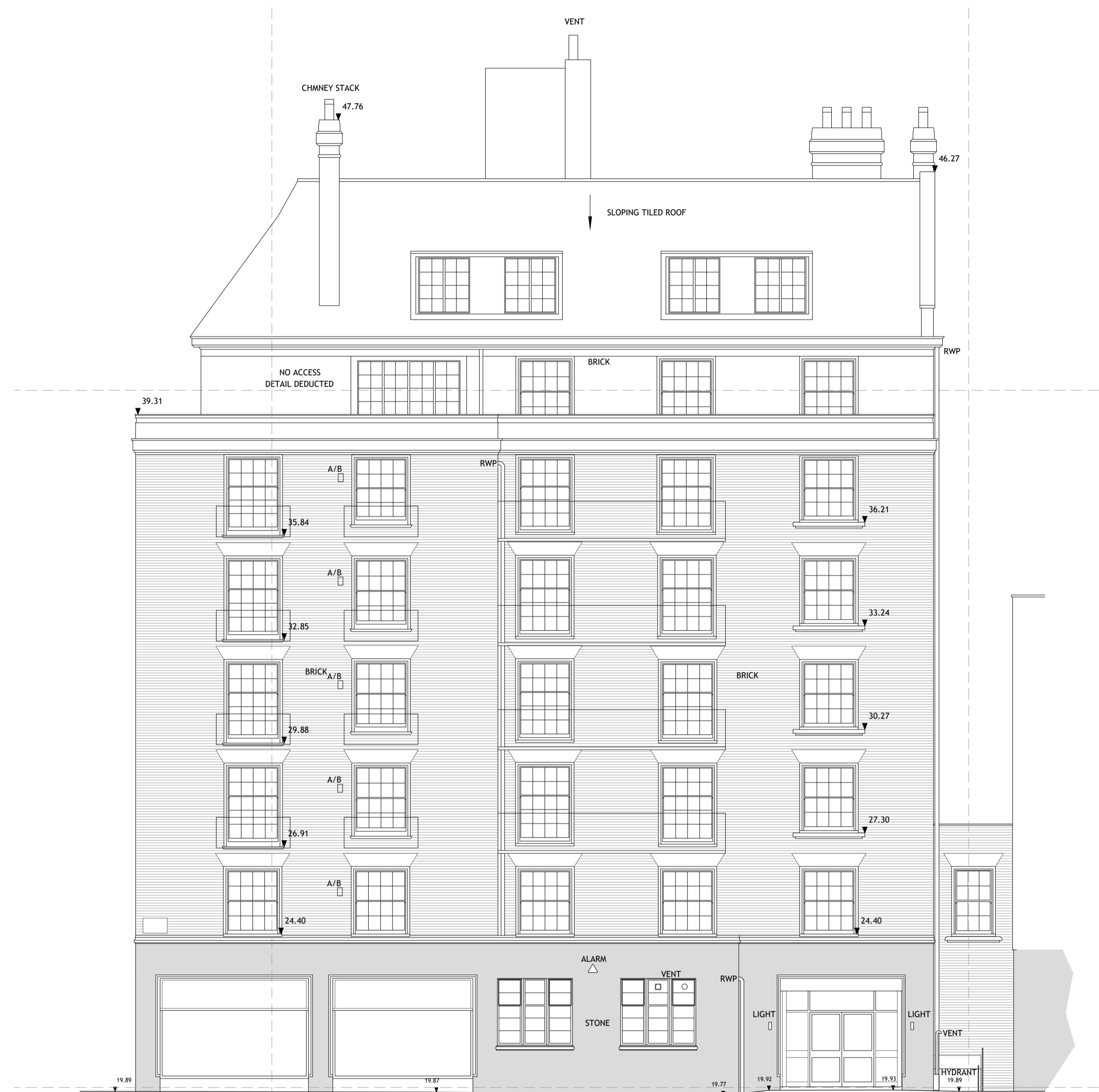
ELEVATION 2 - ALONG REEVES MEWS SCALE 1:100 @ A1