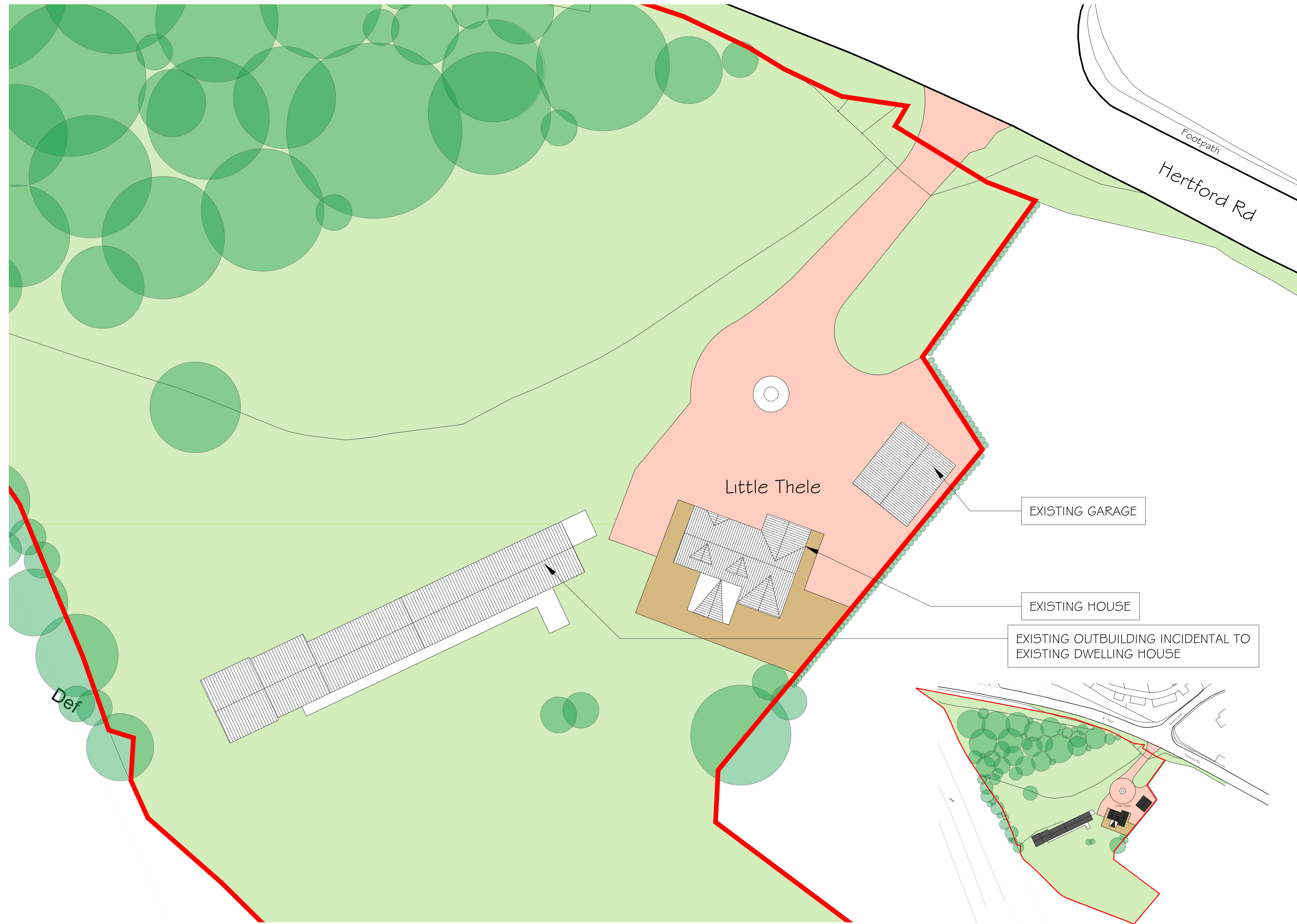
① Existing Site Plan 1:200