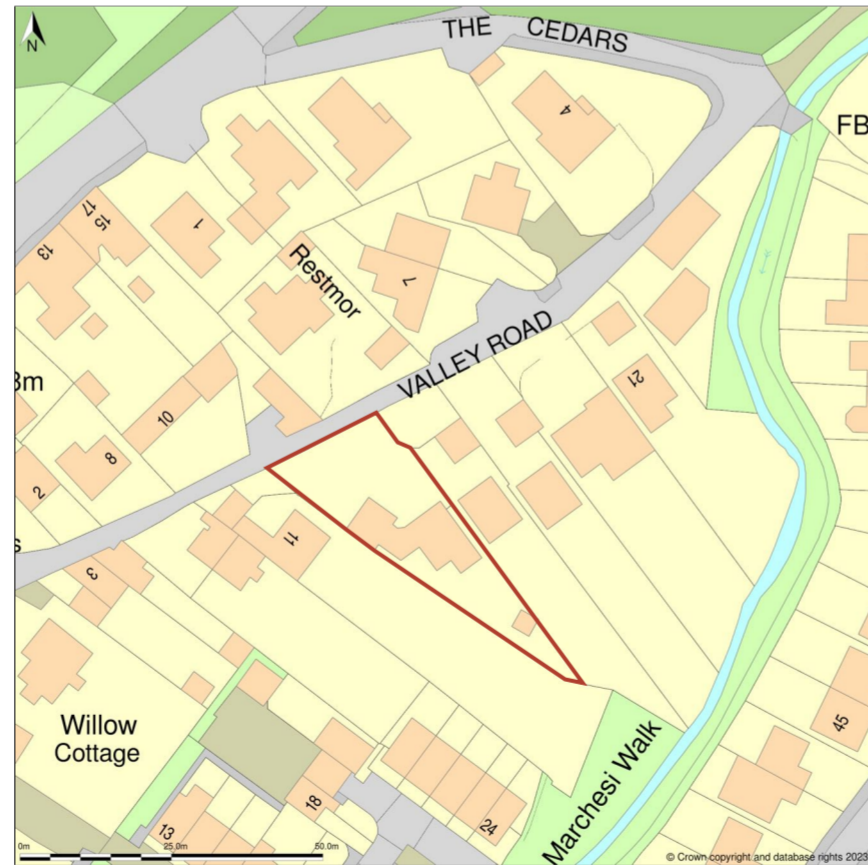
LOCATION PLAN 1 : 1250 @ A2

all dimensions to be confirmed on site all works to be carried out in accordance with current Building Regulations drawings and design copyright of SE Architecture and may not be copied, altered or reproduced without authority