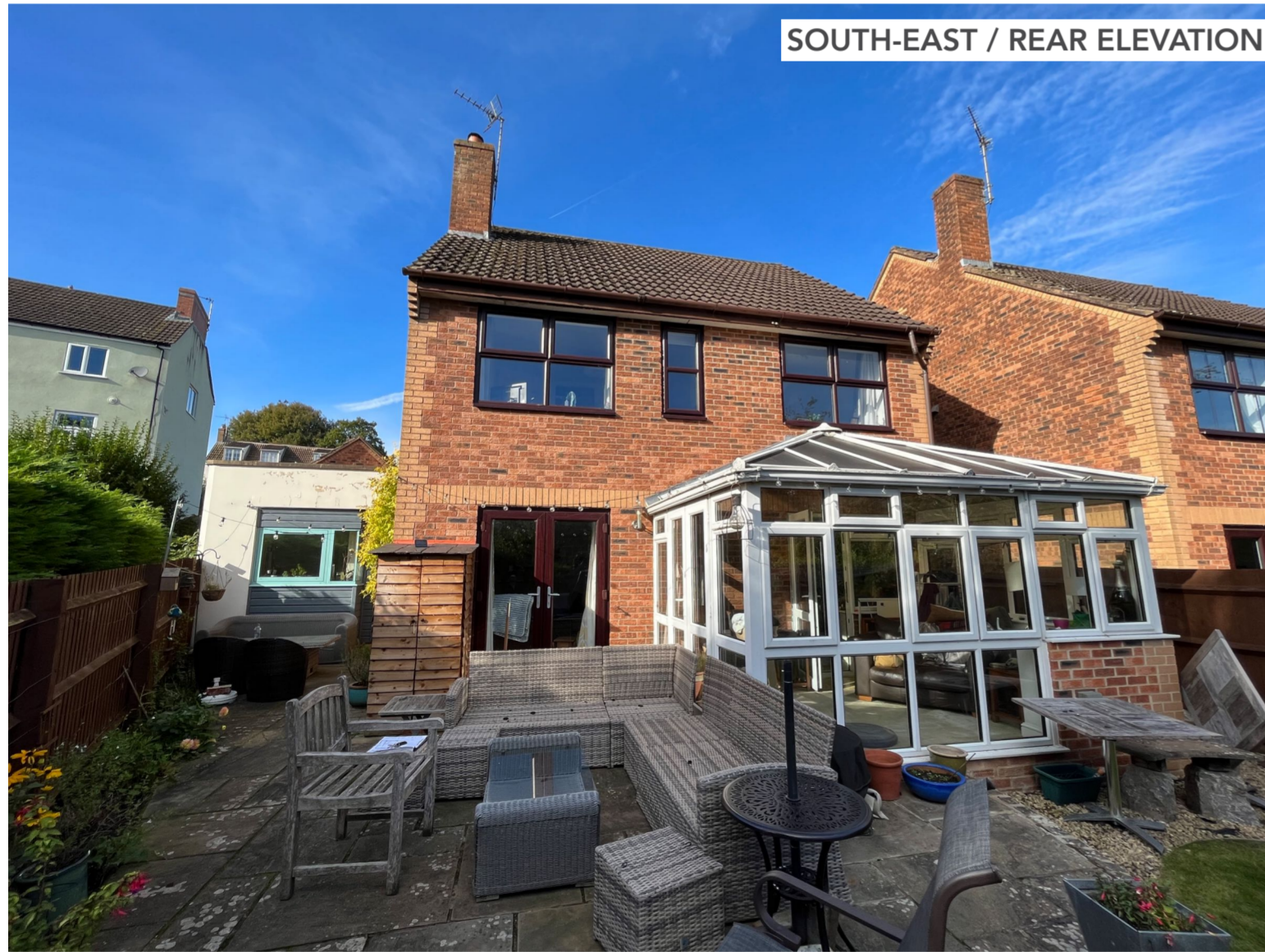
SOUTH-EAST / REAR ELEVATION