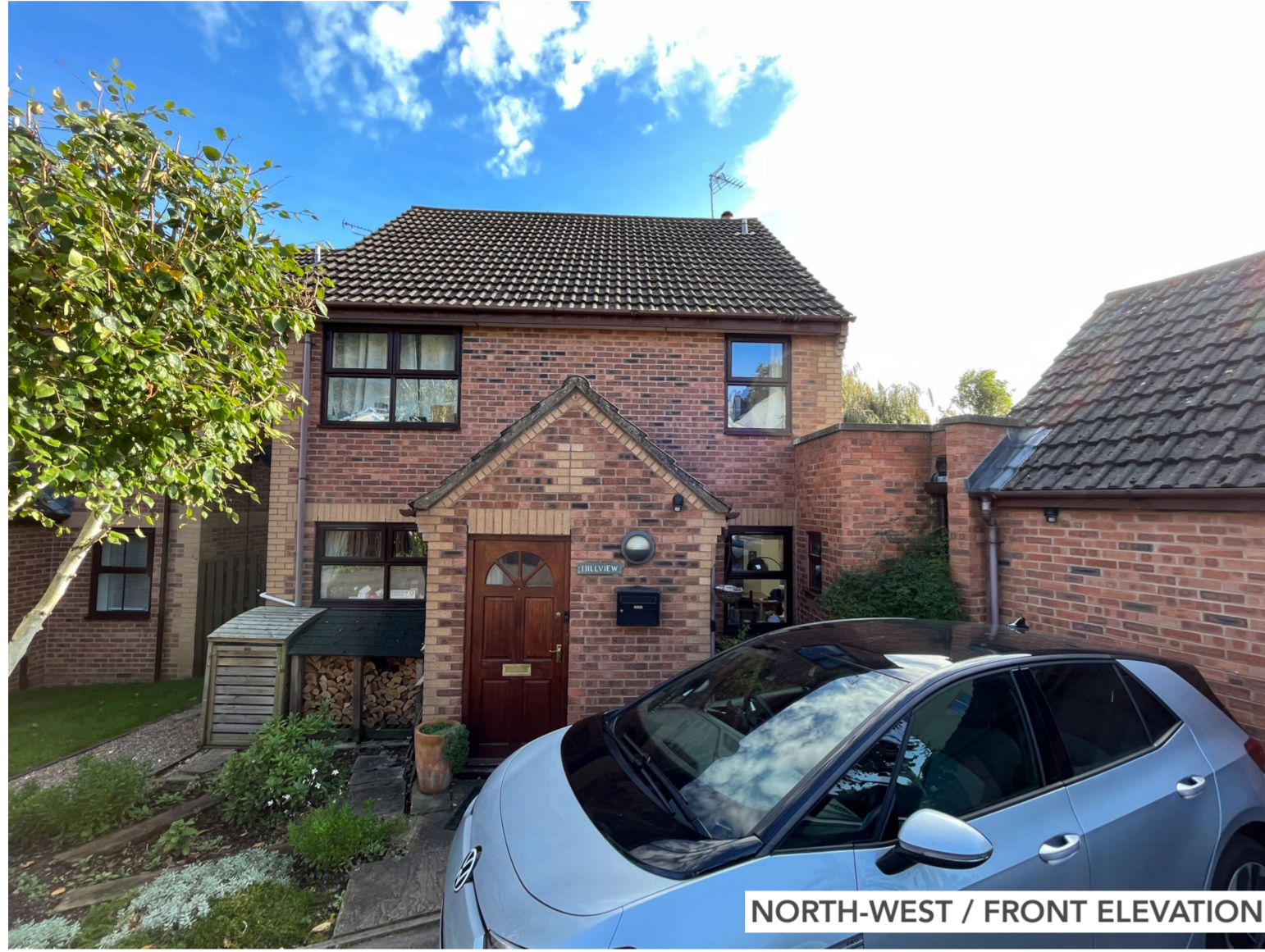
NORTH-WEST / FRONT ELEVATION