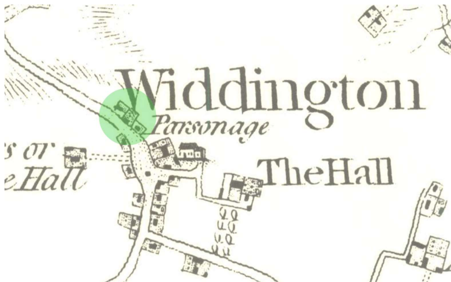
Map 1 Extract of the 1777 Chapman and André map. The approximate location of Pond Mead highlighted in green.

Pond Mead is located in the historic village of Widdington, a small nucleated settlement dating back to the medieval period. A large number of listed buildings reside in Widdington, including Church of St Mary the Virgin (NHLE No. 238372, EHER 36900), and two scheduled moated sites, the hall (EHER 205) and Prior's Hall (NHLE No. 1274214, EHER 199-200). These, along with Pond Mead, are all located within Widdington's conservation area.