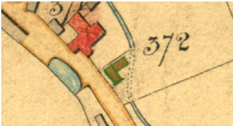
Map 2 Extract of the 1838 tithe map. Pond Mead highlighted in green.