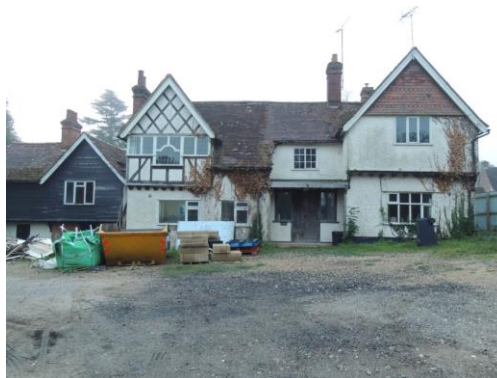
Photo 1: North-western elevation. The proposal is to refurbish the building to create two residential dwellings

Consent has been granted for the Proposed subdivision of dwellinghouse to create 2 no. dwellinghouses. Proposed conversion works, demolition of conservatory, erection of single storey extension, and layout changes, including separate accesses for both plots, separate parking areas and ancillary driveways. at Pond Mead High Street Widdington Saffron Walden Essex CB11 3SB