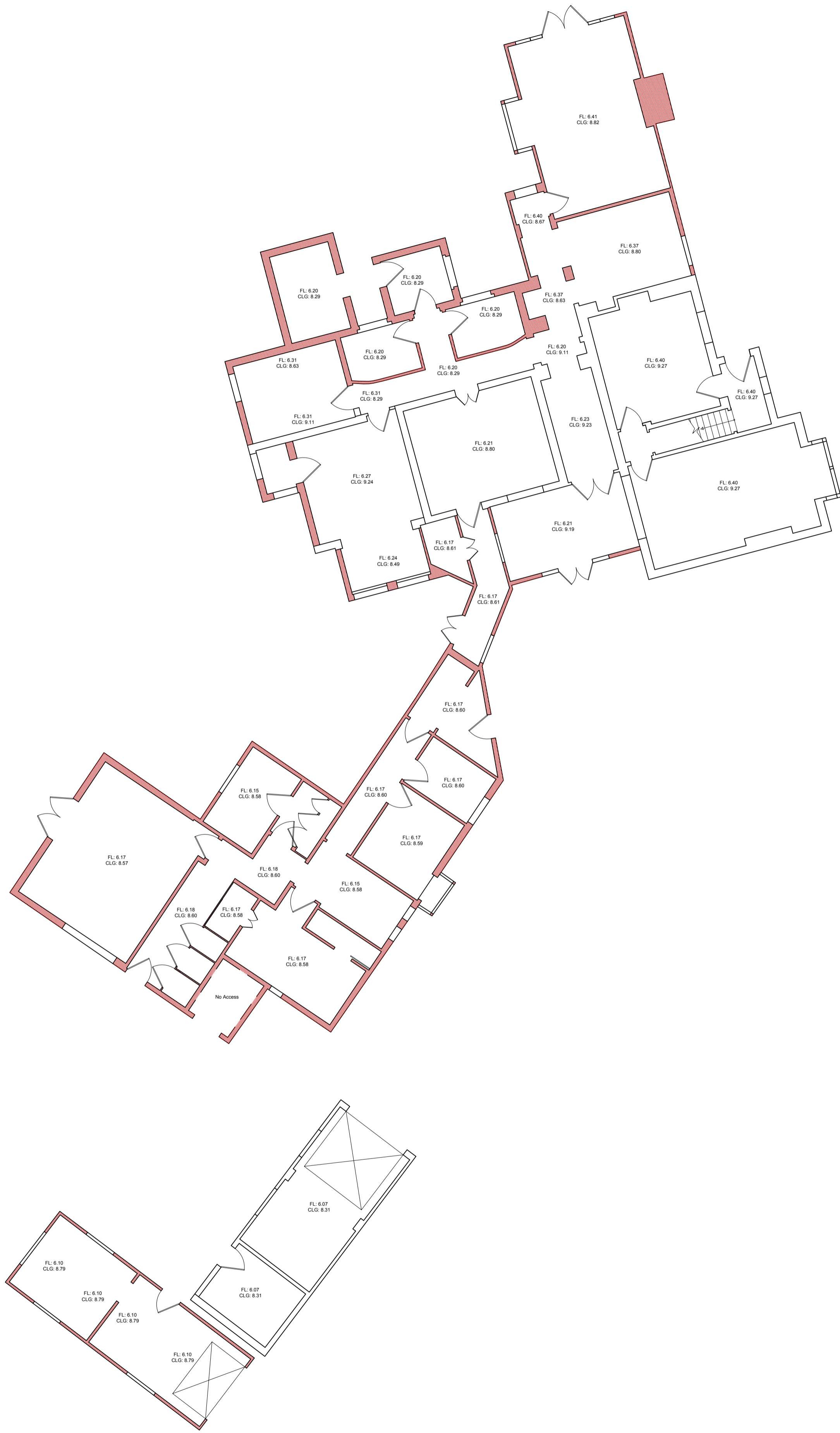
01 Existing Ground Floor Plan EX_100