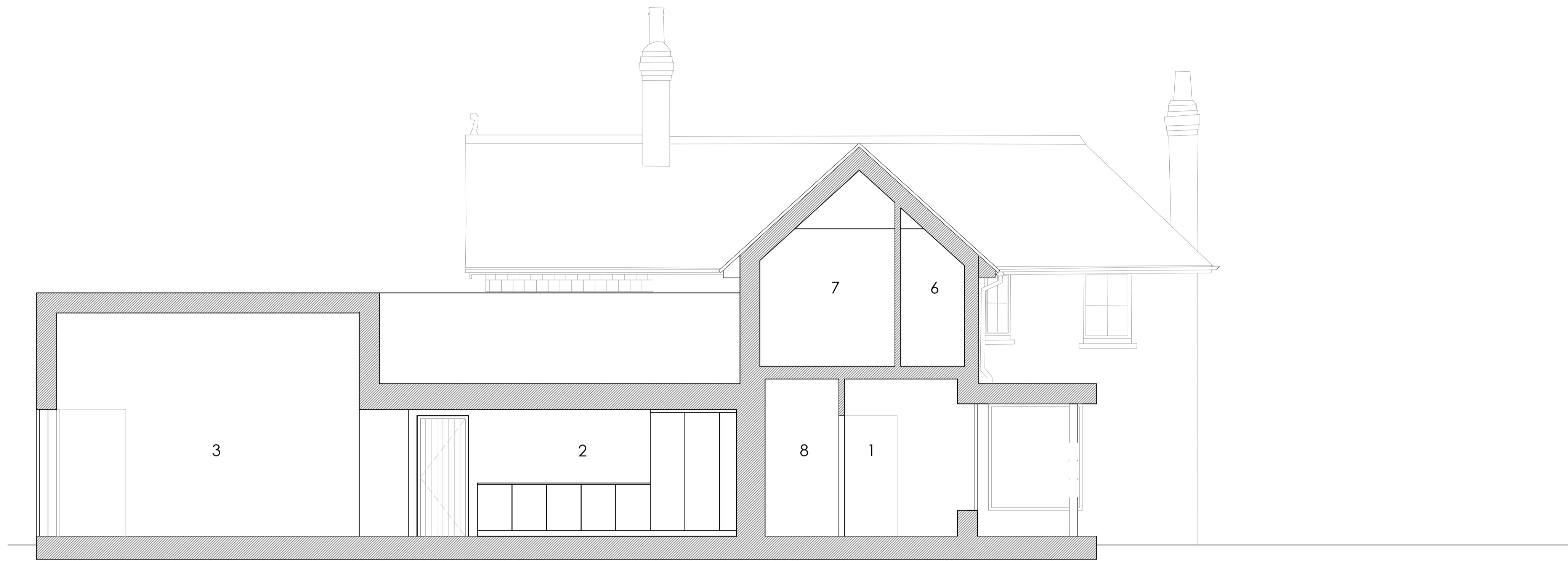
01 Section A:A GA_300