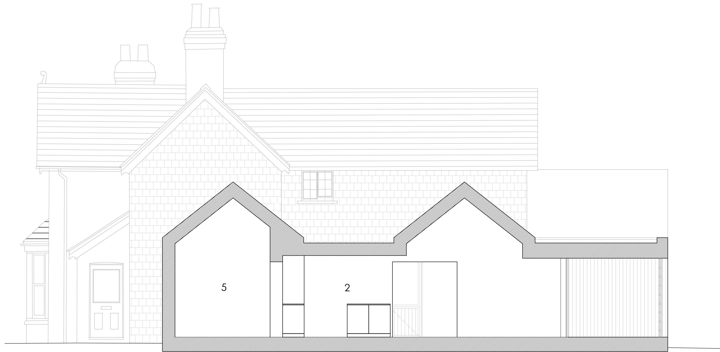
02 Section D:D GA_301