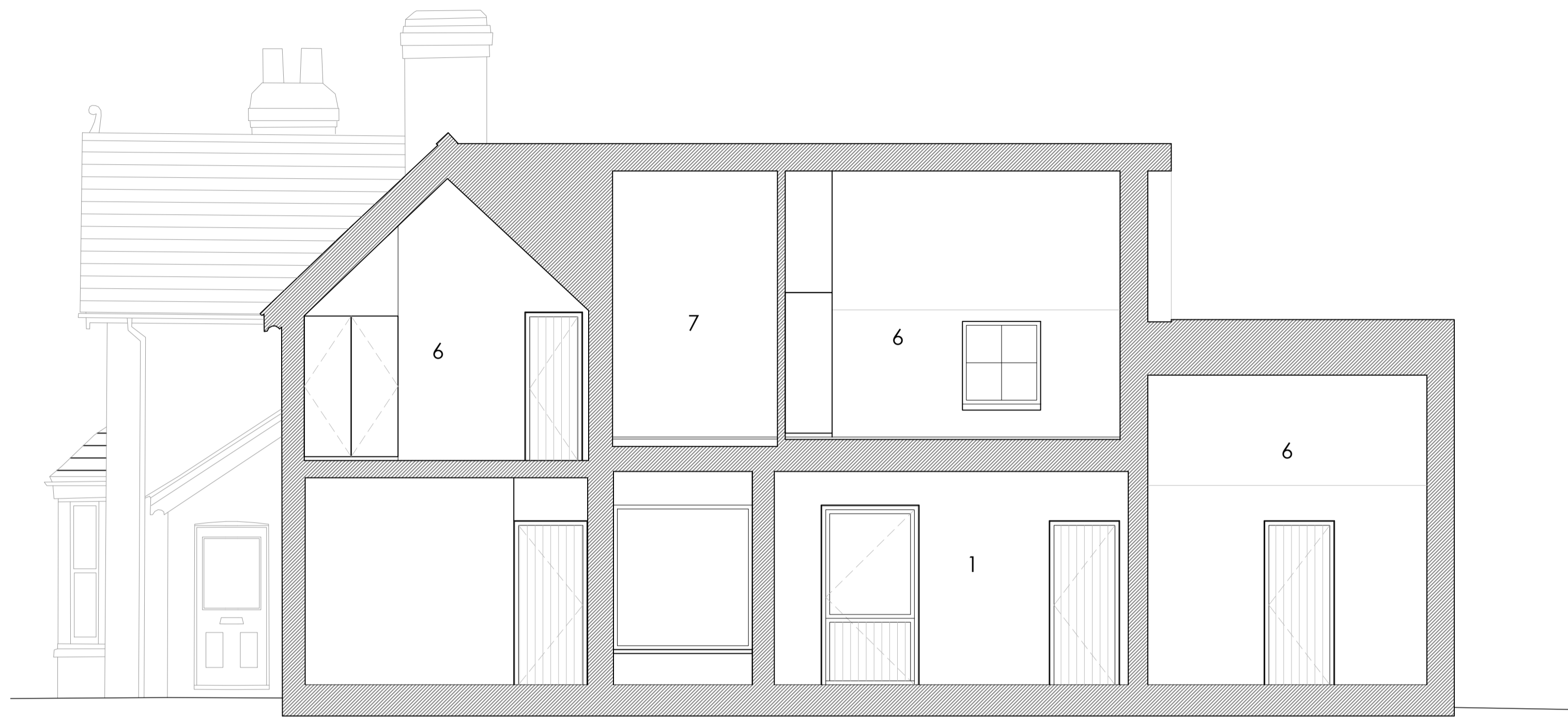
01 Section C:C GA_301