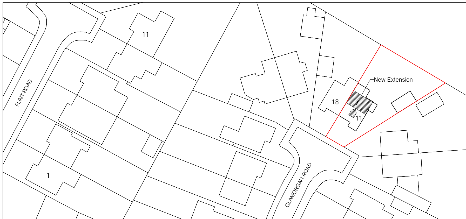
Proposed - SITE PLAN (BLOCK PLAN) 1:500