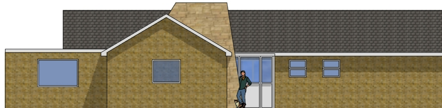
EXISTING LEFT ELEVATION SCALE 1:100 @ A3