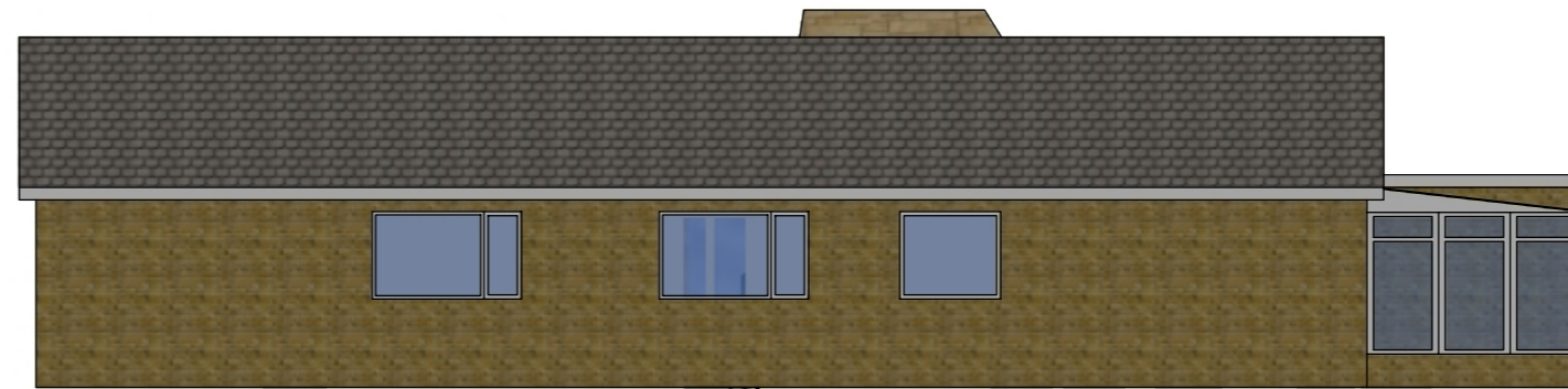
EXISTING RIGHT ELEVATION SCALE 1:100 @ A3