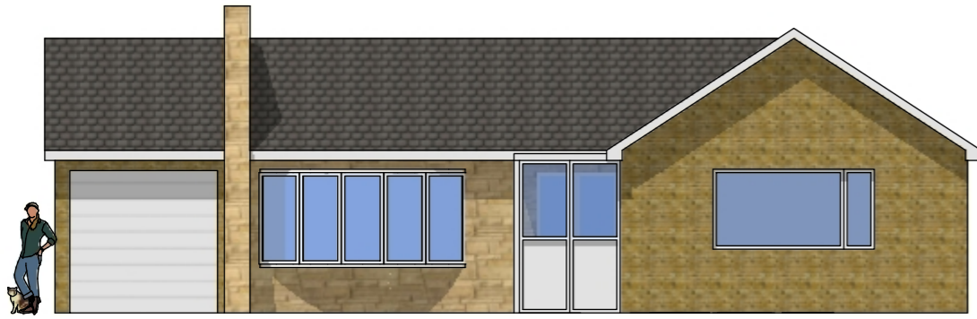
EXISTING FRONT ELEVATION SCALE 1:100 @ A3