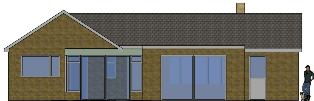
EXISTING REAR ELEVATION SCALE 1:100 @ A3