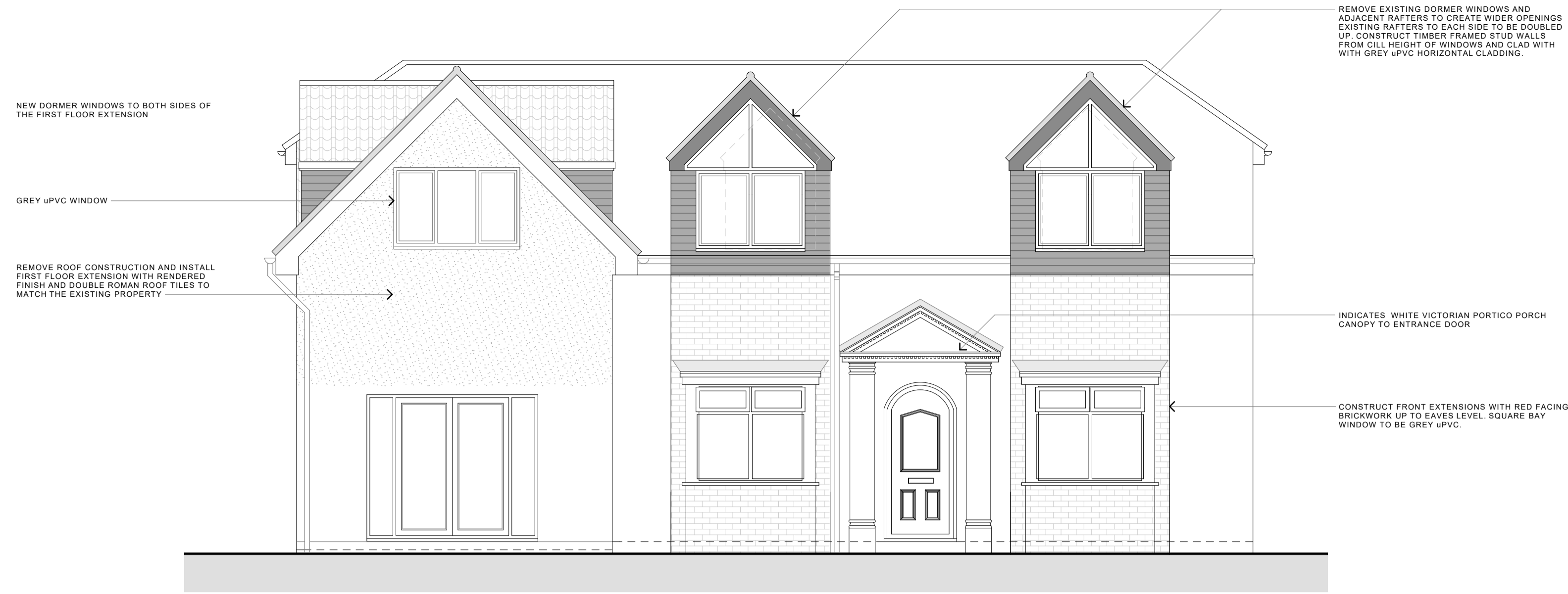
PROPOSED FRONT (SOUTH-EAST) ELEVATION