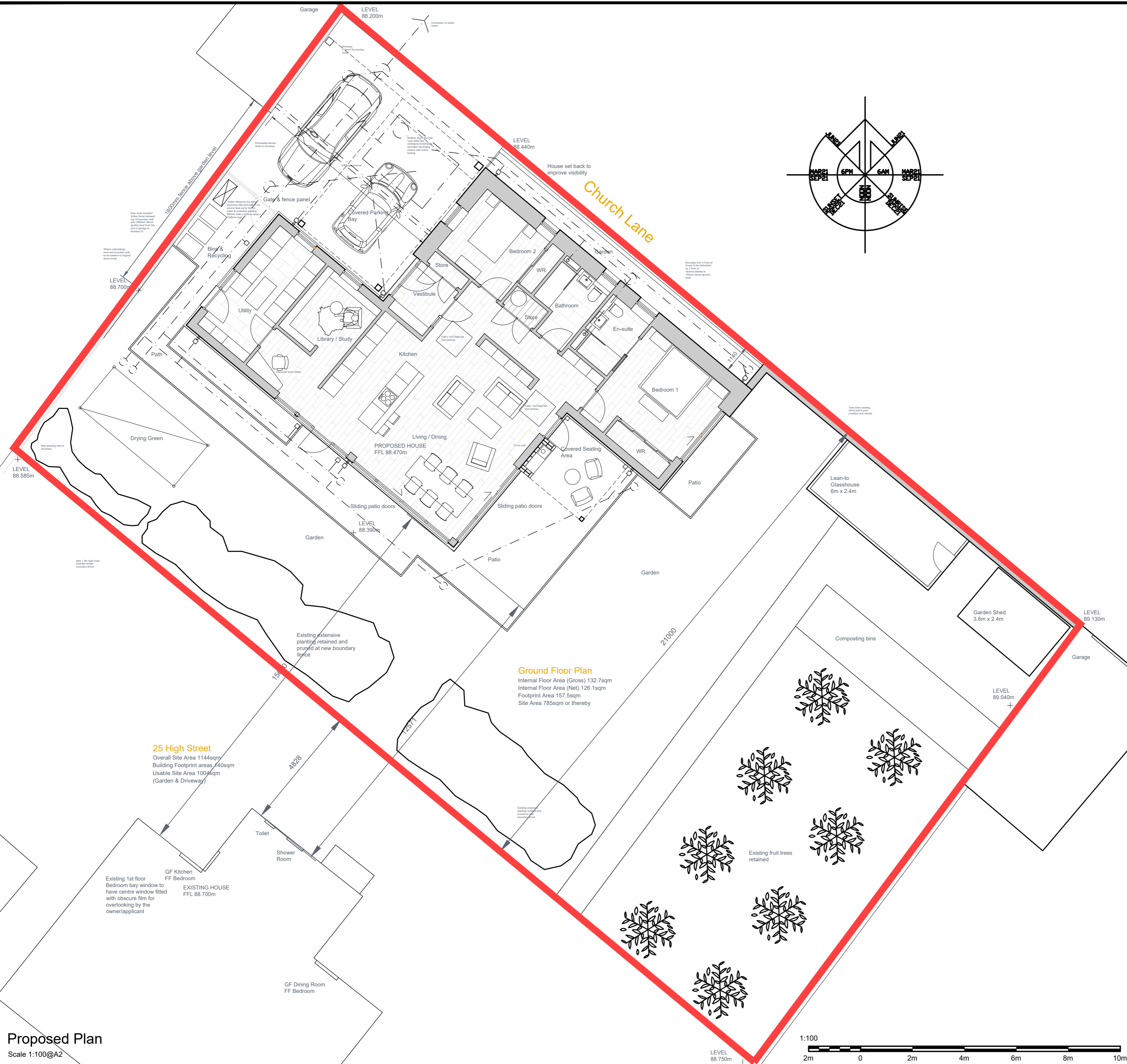
Ground Floor Plan Internal Floor Area (Gross) 132.7sqm Internal Floor Area (Net) 126.1sqm Footprint Area 157.5sqm Site Area 785sqm or thereby

25 High Street Overall Site Area 1144sqm Building Footprint areas 440sqm Usable Site Area 1004sqm (Garden & Driveway)