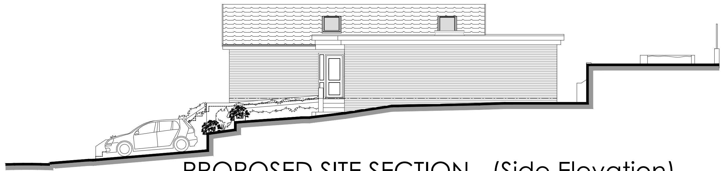
PROPOSED SITE SECTION - (Side Elevation)