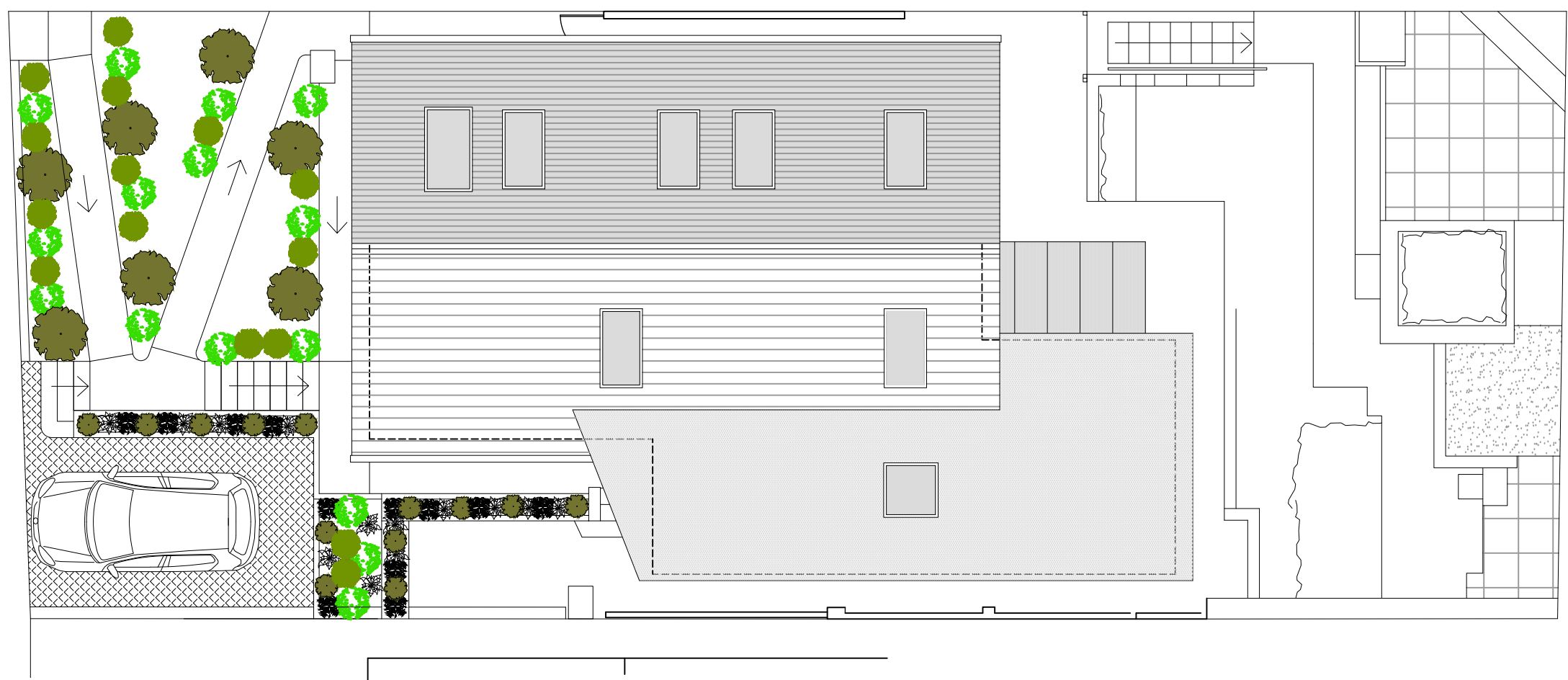
PROPOSED SITE/ROOF PLAN