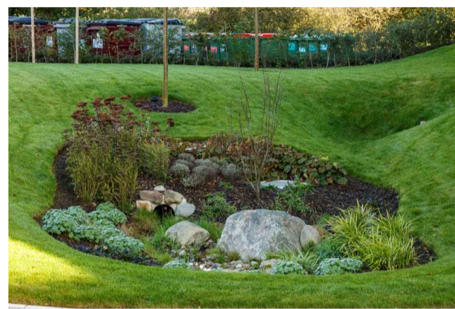
EXAMPLE OF RETENTION BASIN