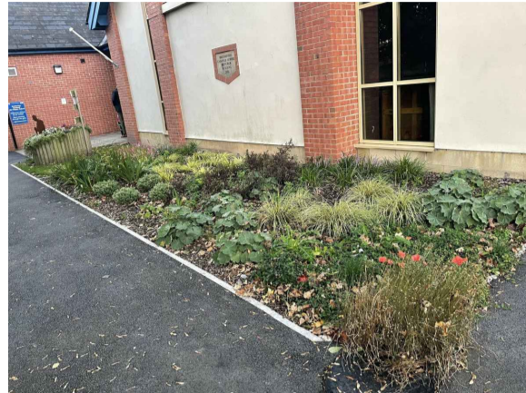
EXAMPLE OF RAINGARDEN