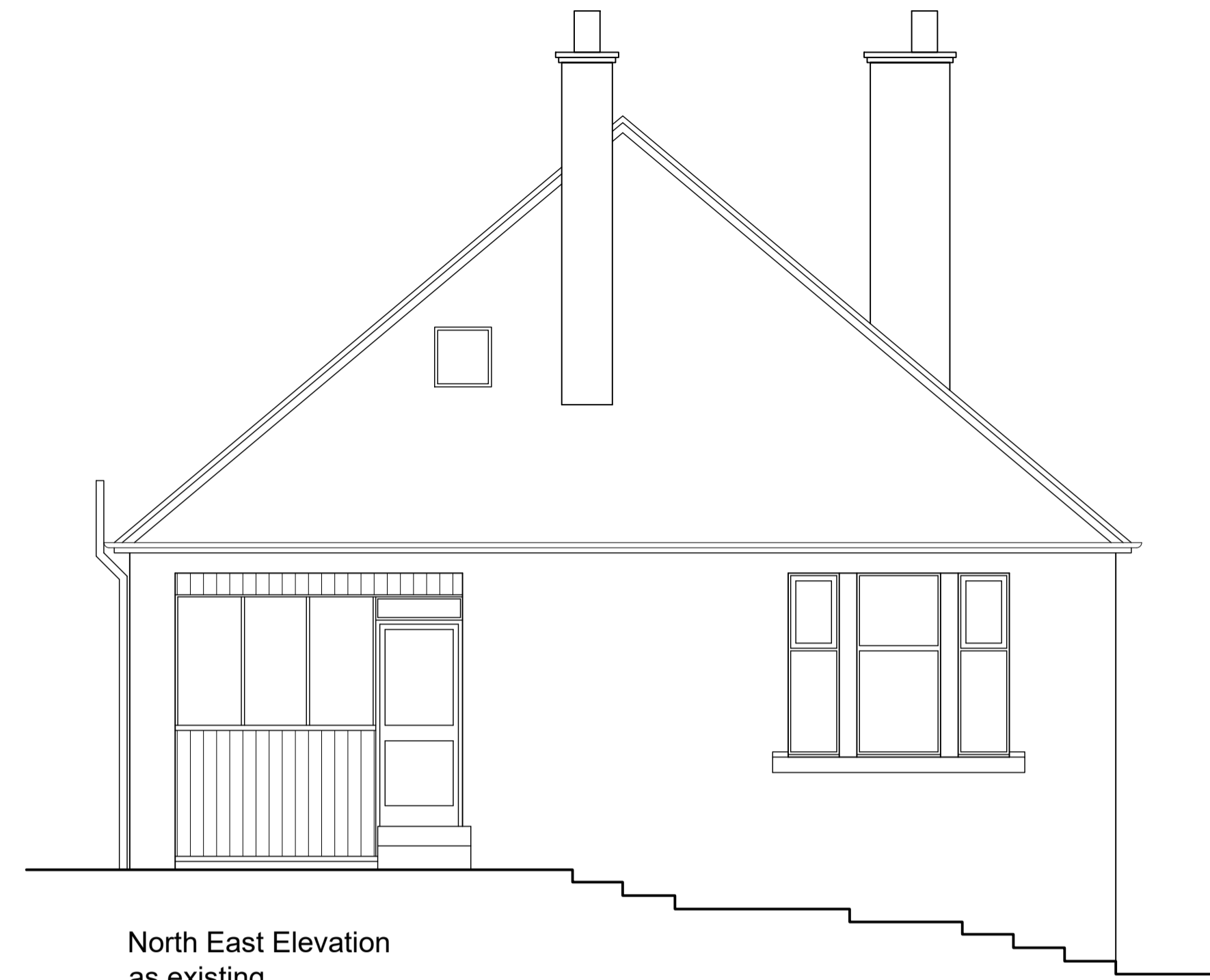
North East Elevation as existing 1:50@A1