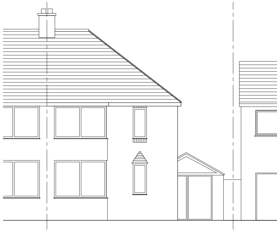
EXISTING FRONT ELEVATION SCALE, 1:100