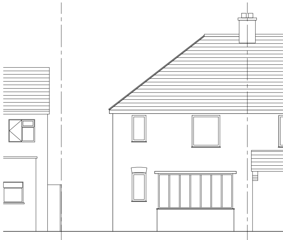
EXISTING REAR ELEVATION SCALE, 1:100