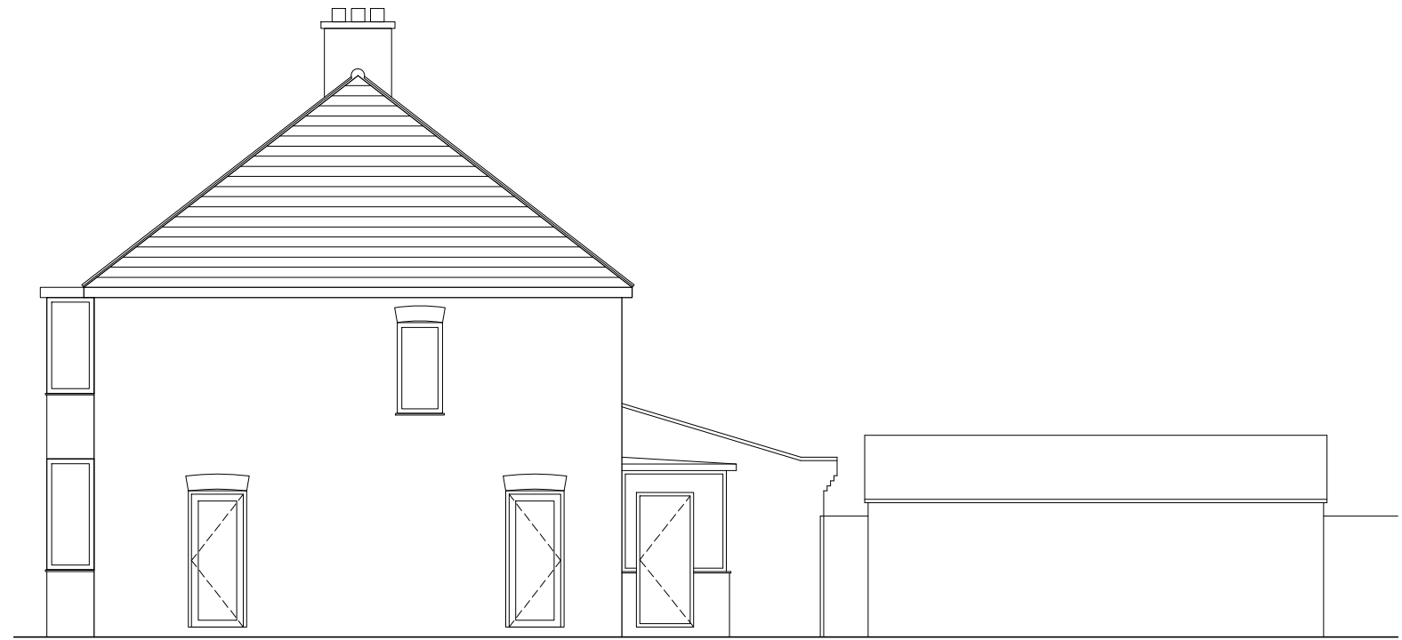
EXISTING R. SIDE ELEVATION SCALE, 1:100