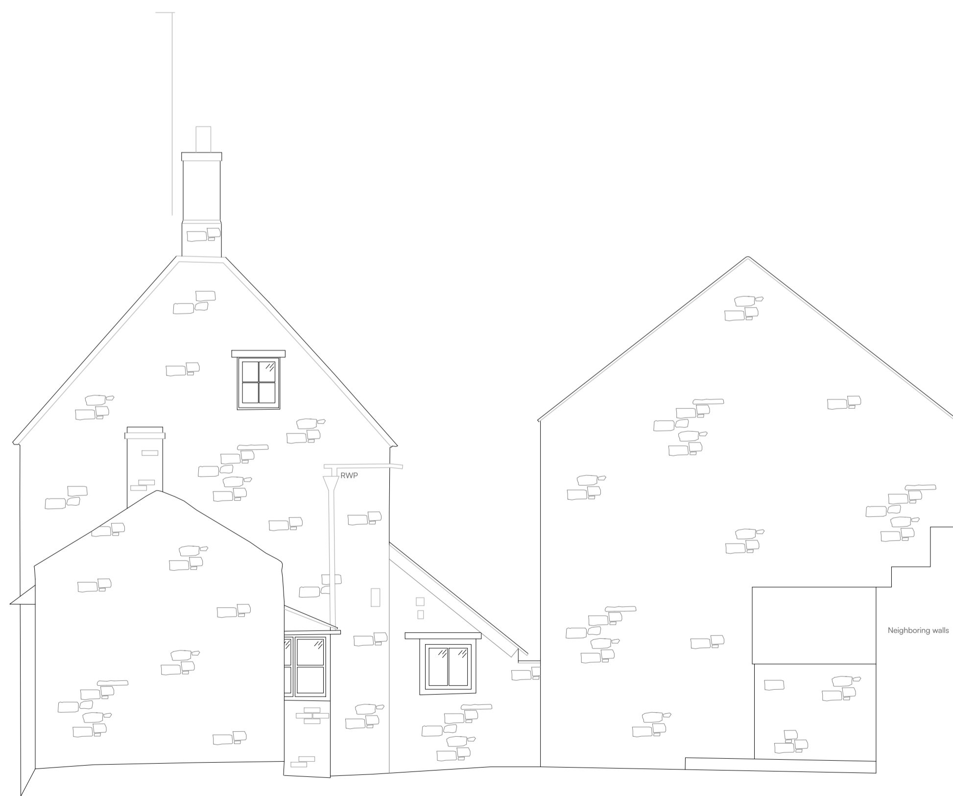
Existing North Elevation Scale 1:50