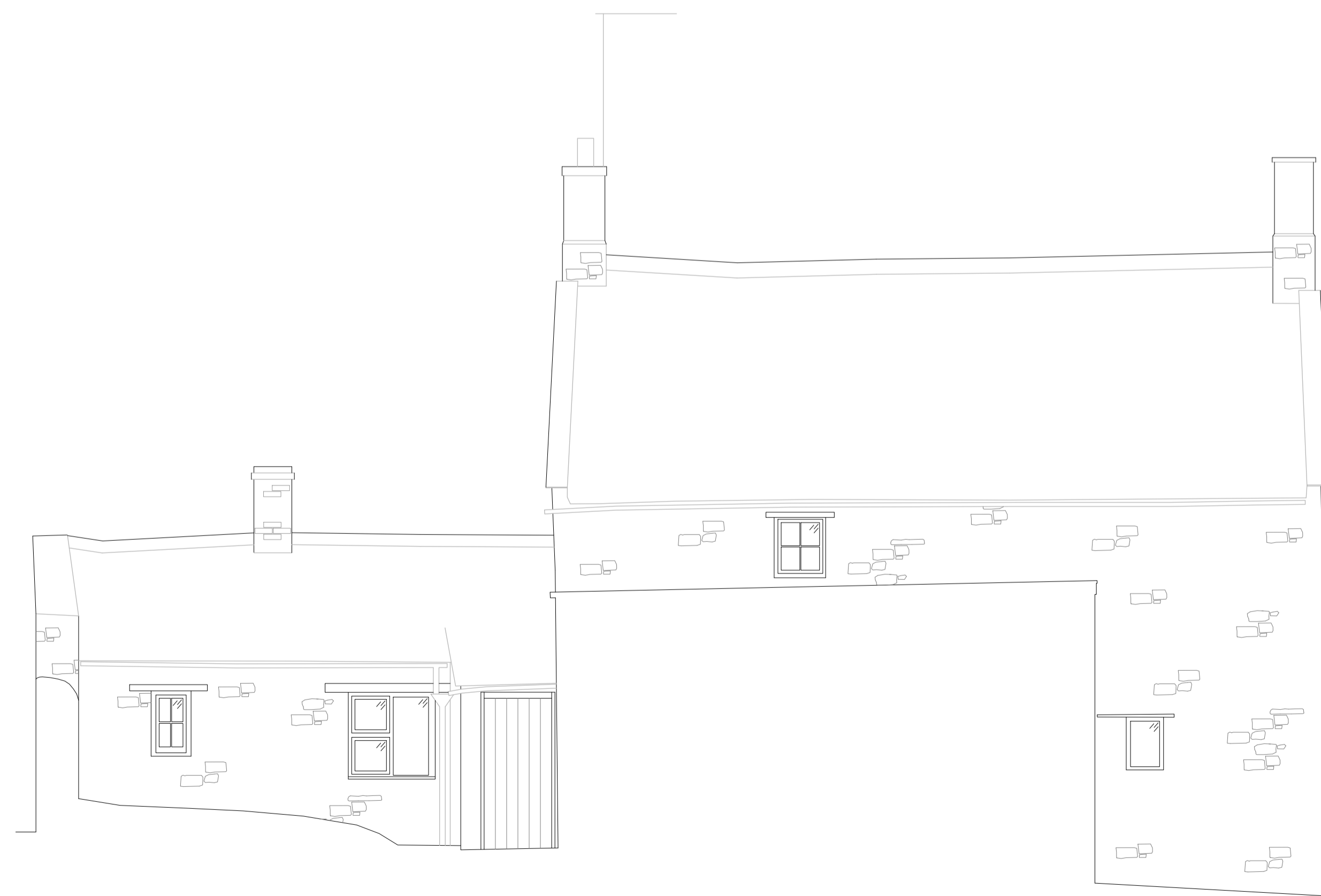
Existing West Elevation Scale 1:50