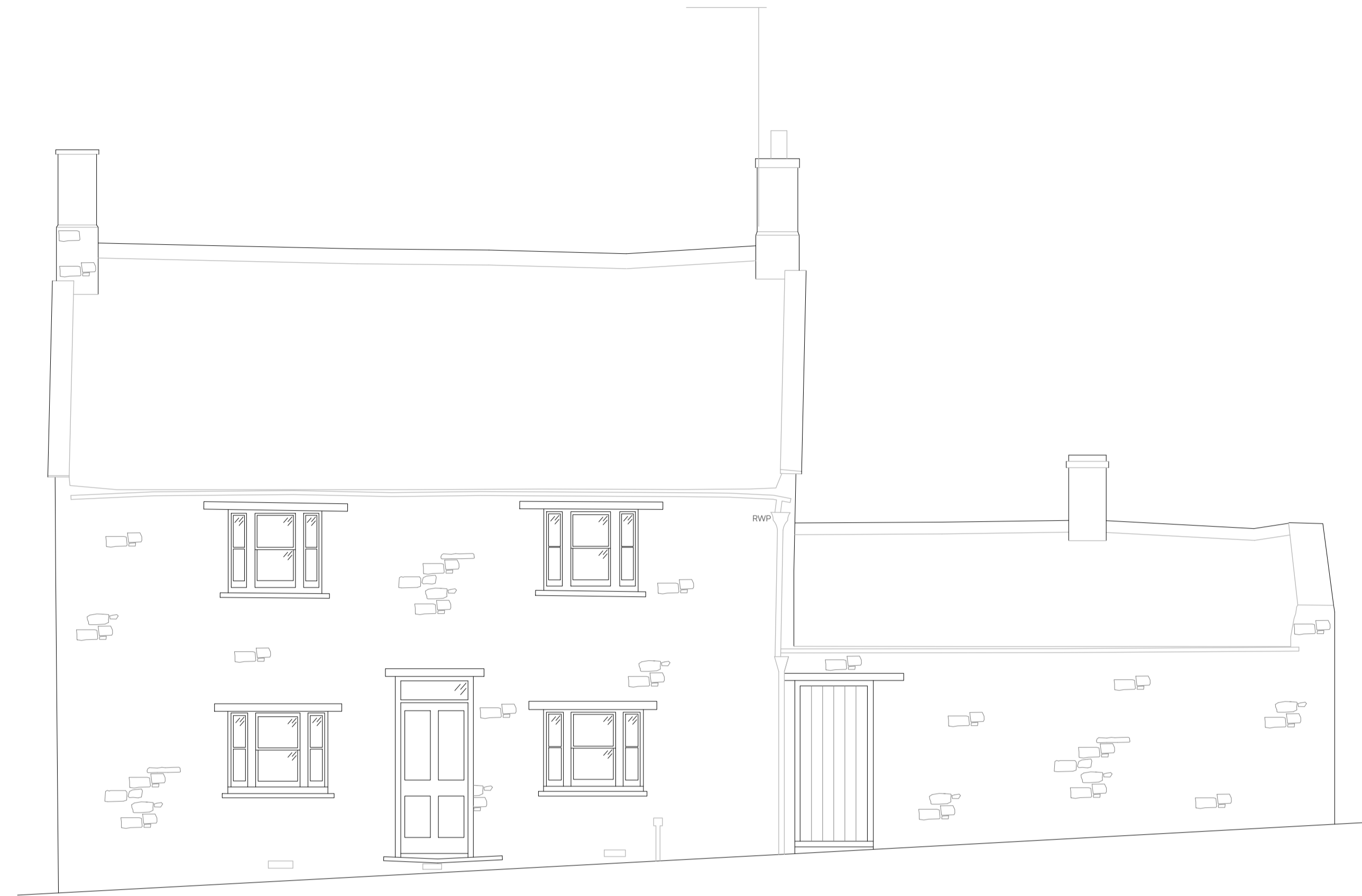
Existing East Elevation Scale 1:50