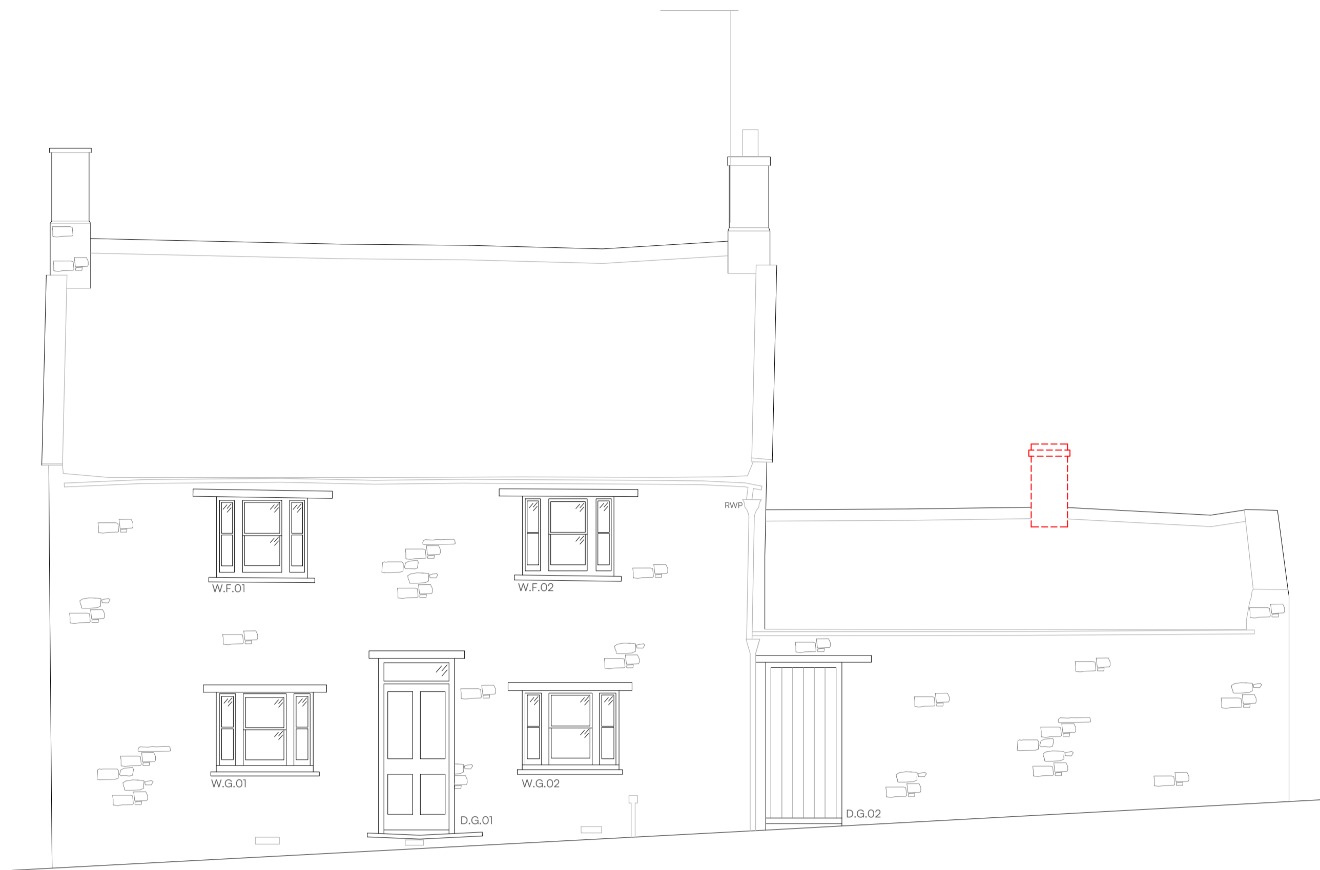
Proposed East Elevation Scale 1:50