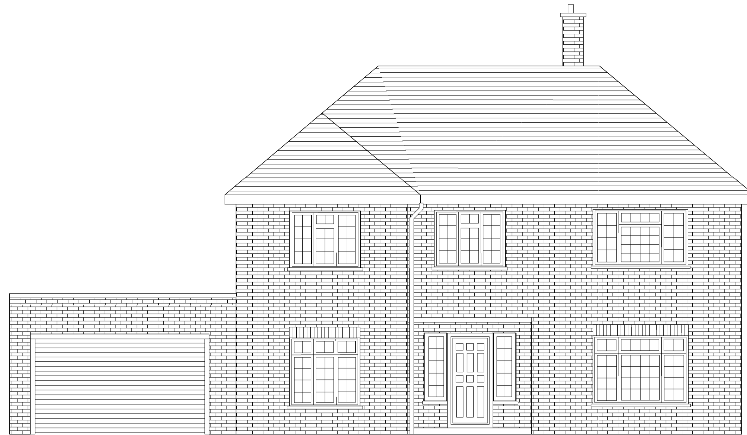
Front Elevation Existing