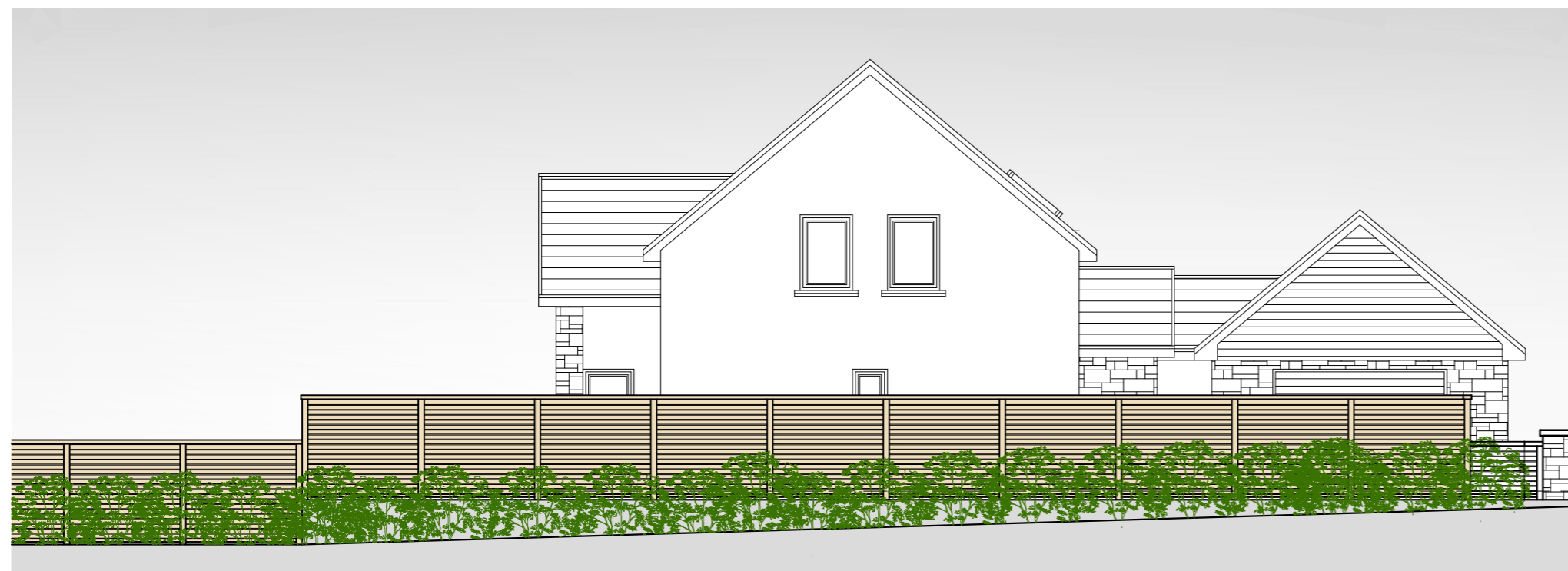
Proposed Streetscape Elevations 1:100