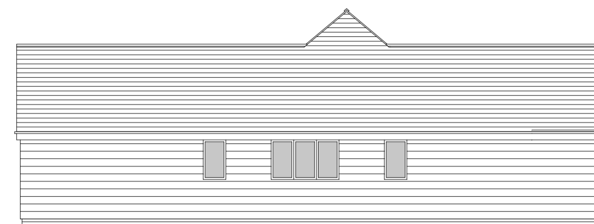
Proposed Side (East) Elevation 1:100