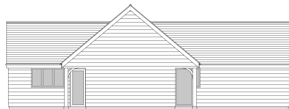
Proposed Side (West) Elevation 1:100