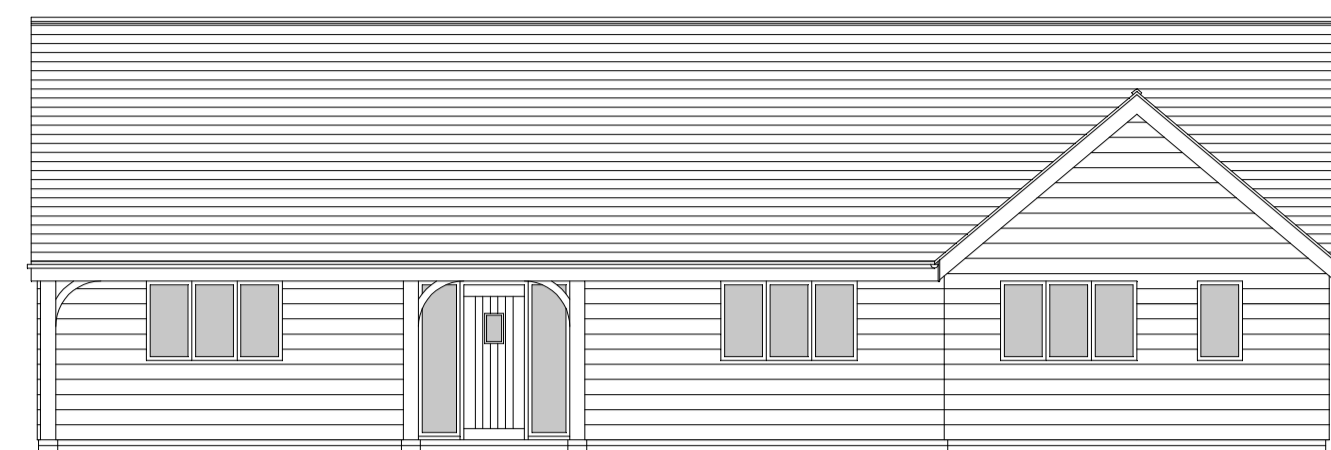
Proposed Front (South) Elevation 1:100