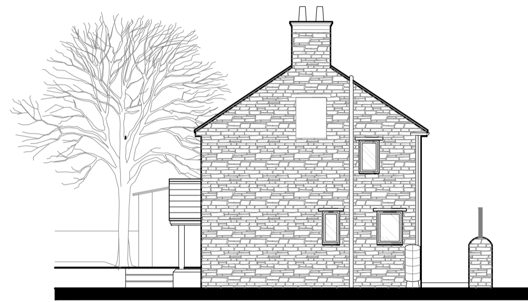
Existing West Elevation 1:100