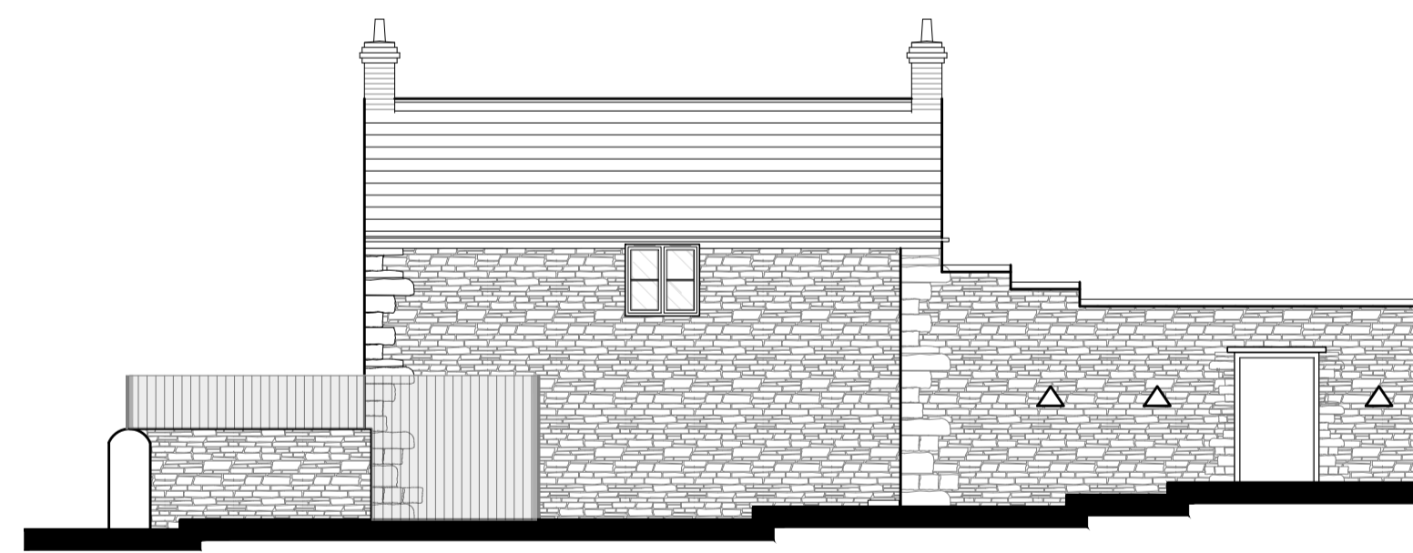
Existing South Elevation 1:100