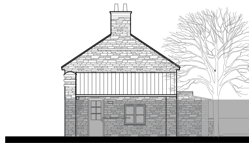
Existing East Elevation 1:100