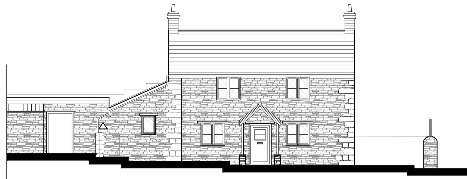
Existing North Elevation 1:100