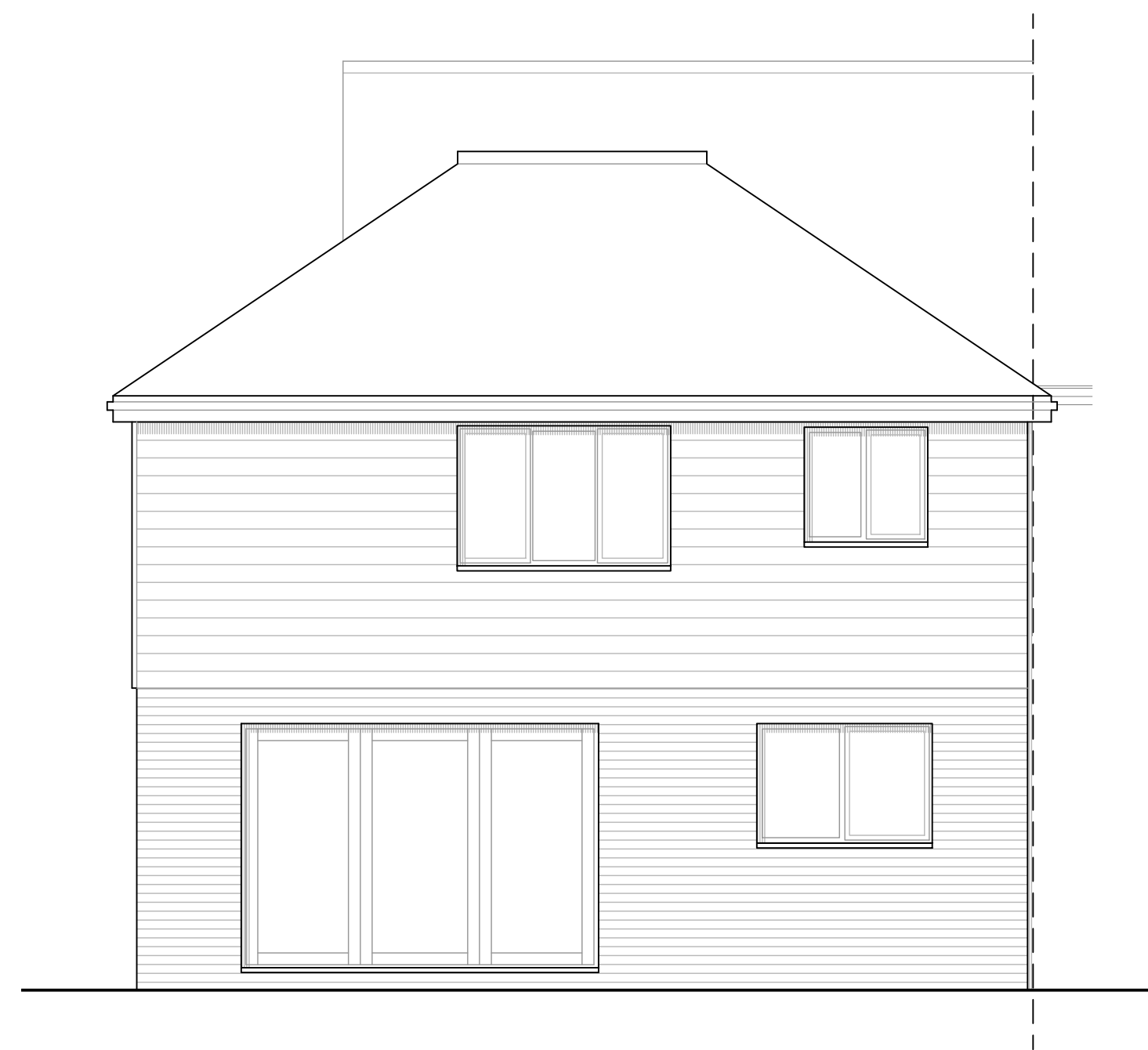
PROPOSED WEST ELEVATION SCALE 1:50