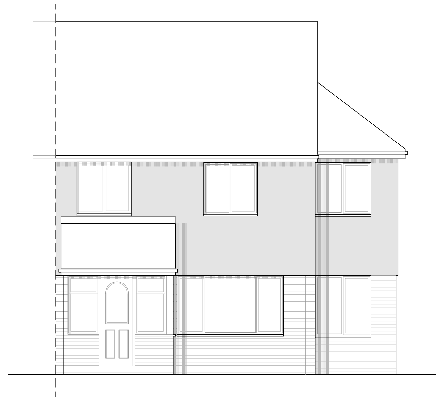
PROPOSED EAST ELEVATION SCALE 1:50