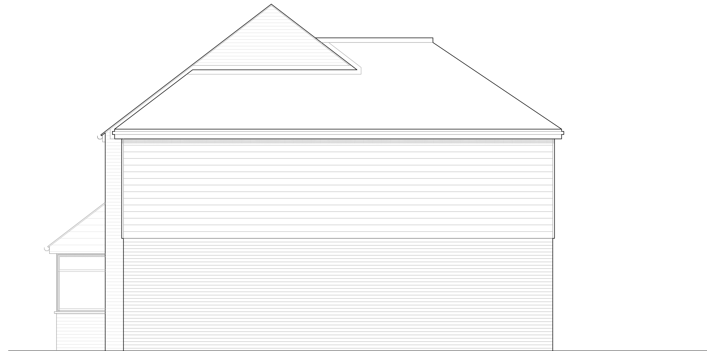
PROPOSED NORTH ELEVATION SCALE 1:50

Notes Do Not Scale. Report all discrepancies, errors and omissions. Verify all dimensions on site before commencing any work on site or preparing shop drawings. All materials, components and workmanship are to comply with the relevant British Standards, Codes of Practice, and appropriate manufacturers recommendations that from time to time shall apply. For all specialist work, see relevant drawings. This drawing is copyright of Kent Design Studio Ltd