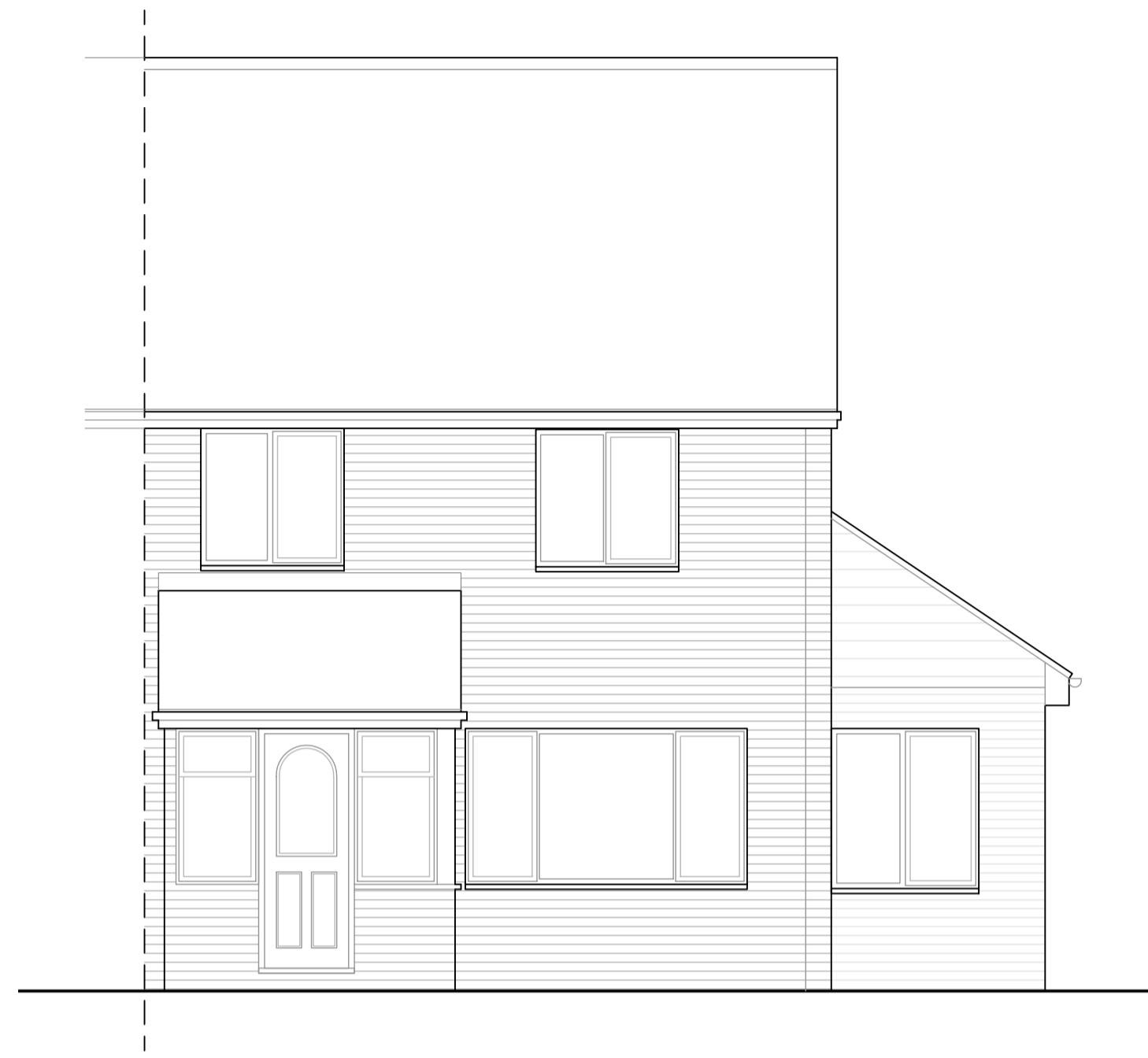
EXISTING EAST ELEVATION SCALE 1:50