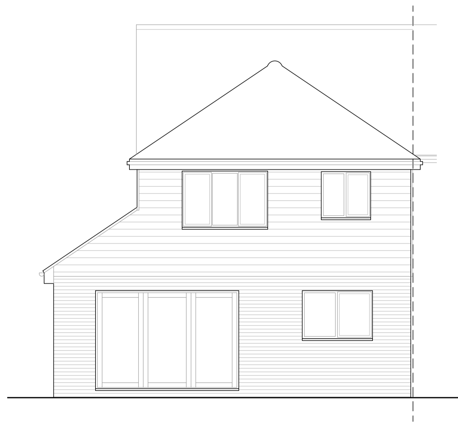
EXISTING WEST ELEVATION SCALE 1:50