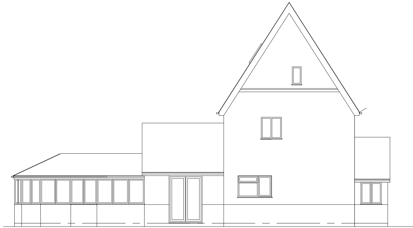
SIDE (SOUTH) ELEVATION