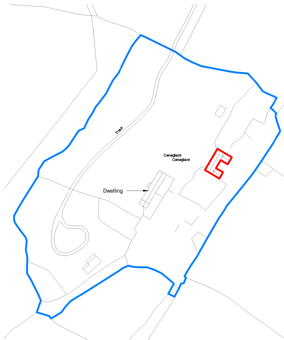
Site Location 1: 1250