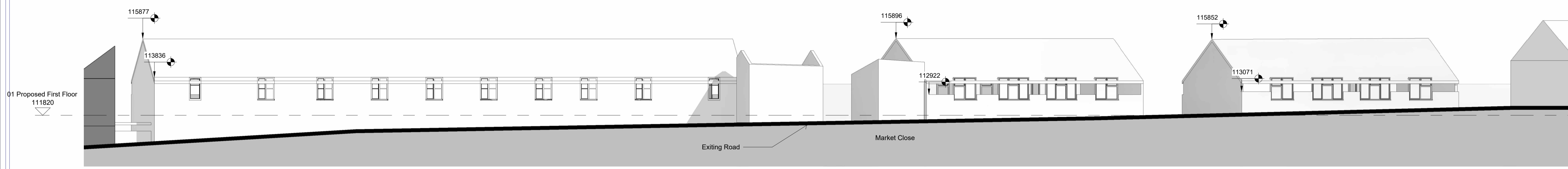
2 EXISTING ELEVATION 02 1 : 100