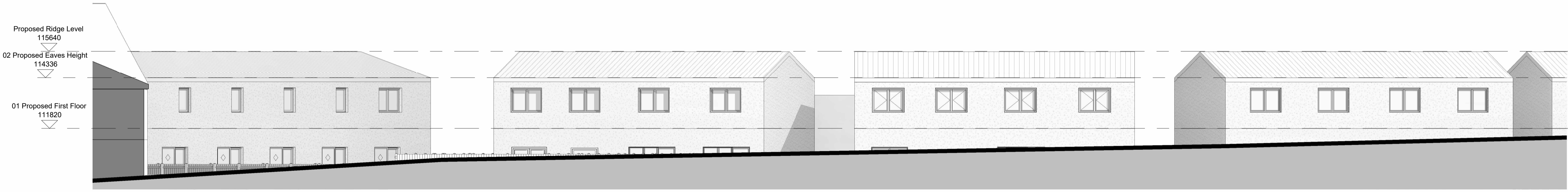
2 PROPOSED ELEVATION 02 1 : 100