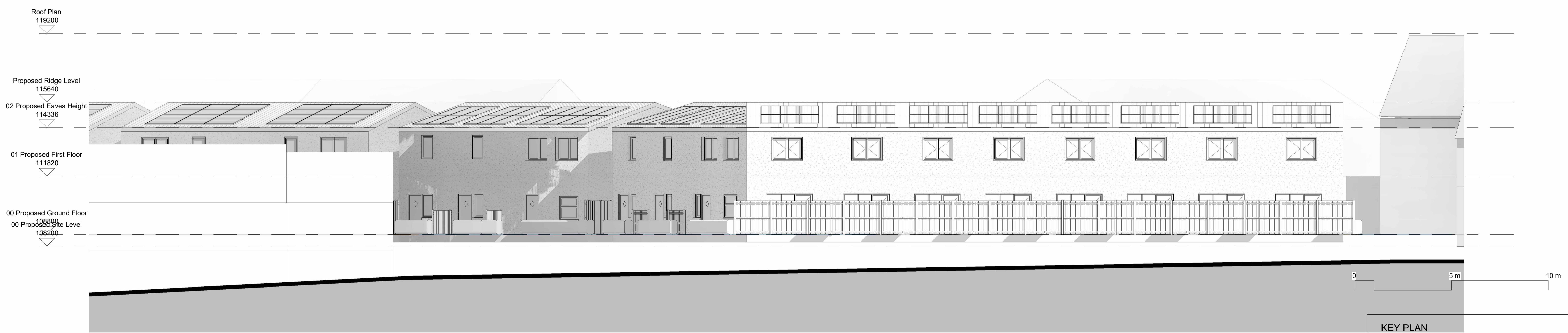
3 PROPOSED ELEVATION 03 1 : 100