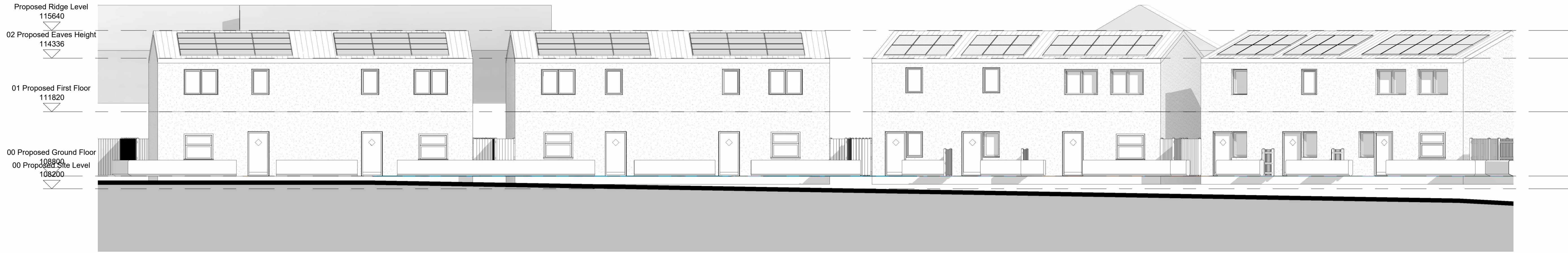
1 PROPOSED ELEVATION 01 1 : 100