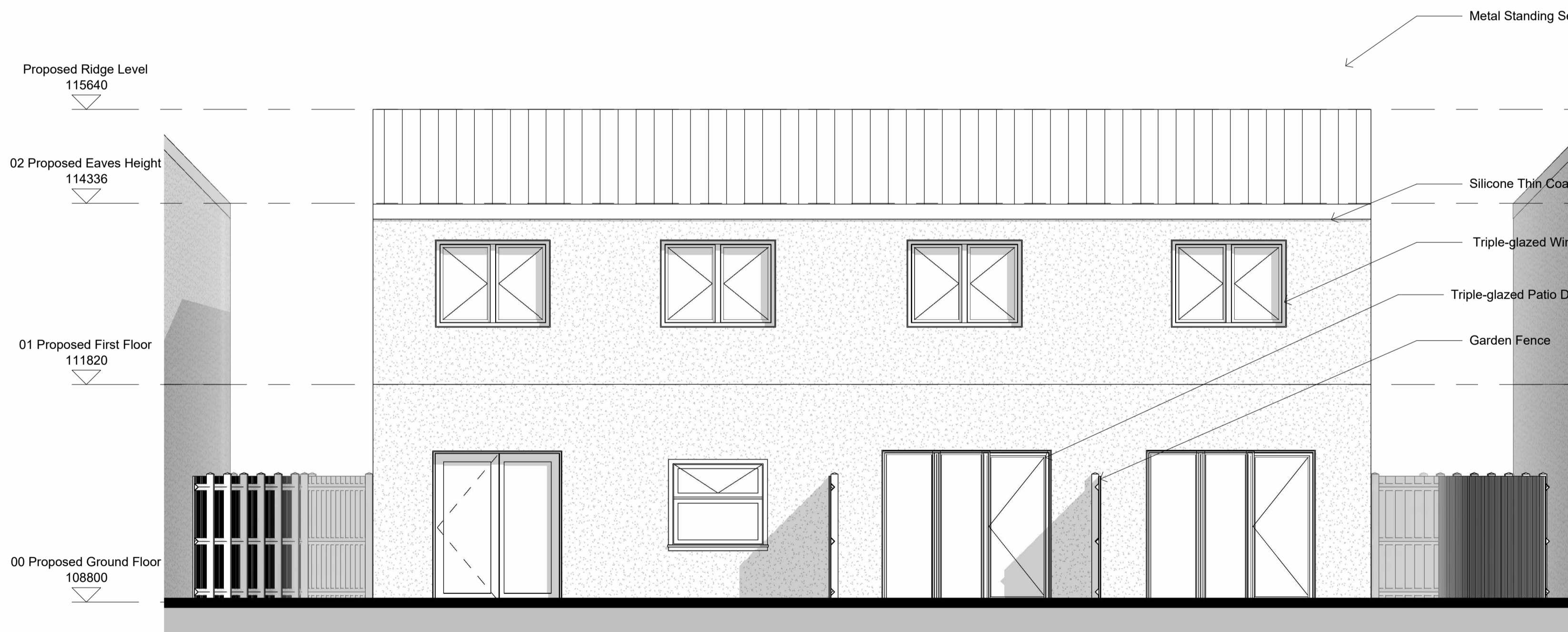
1 PROPOSED BLOCK 3 NORTH ELEVATION 1 : 50