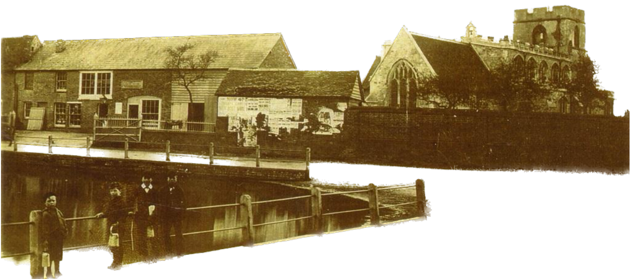
Fig.3 Historic Photograph of the Old Post Office with shop and storage areas connected. Photograph shows how the building looked prior to the 1990's renovation.